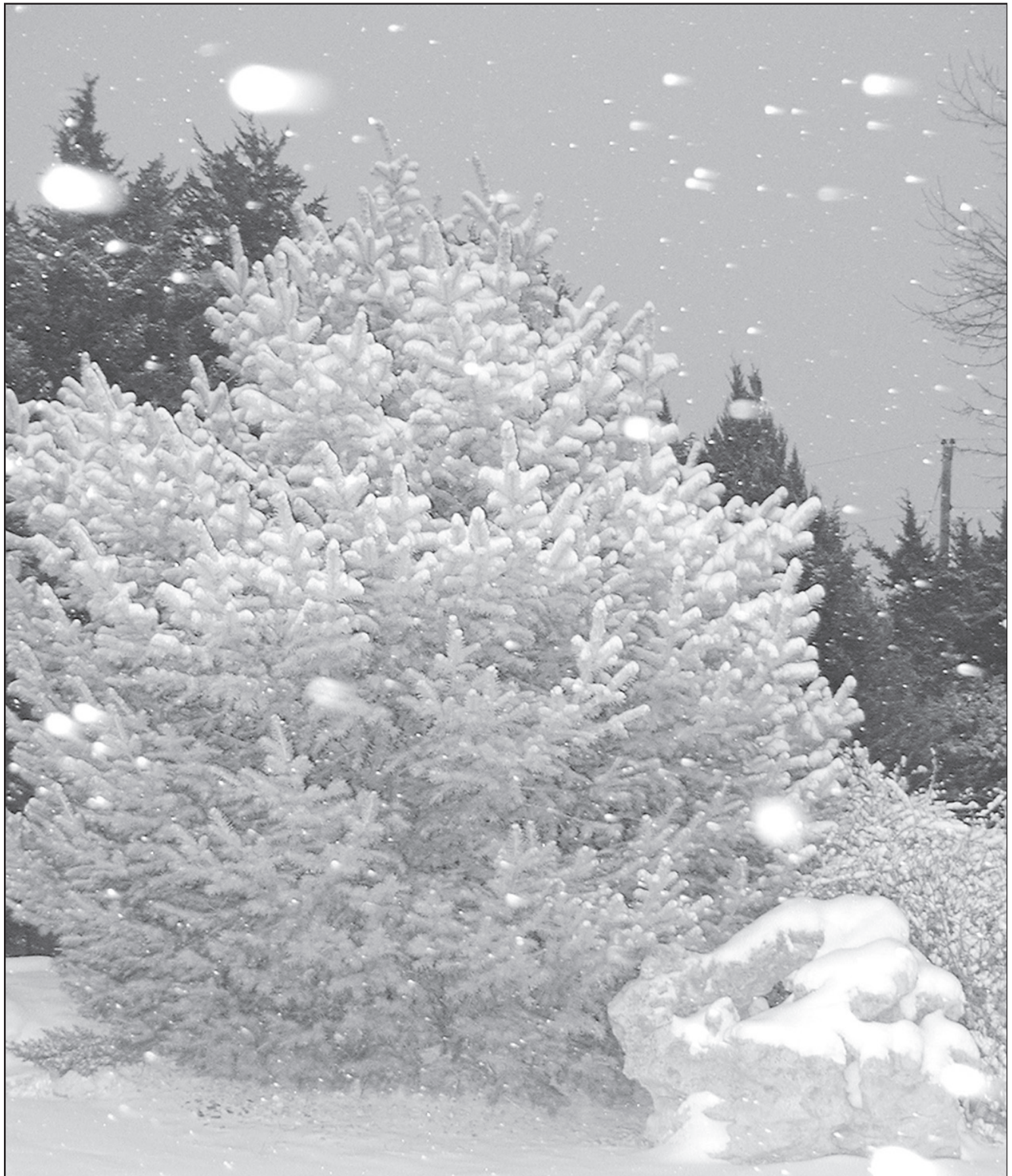
BIG SNOWFLAKES WERE HITTING the ground Monday morning, putting a white frosting on trees and everything else it touched. The sun came out Tuesday and melted some of the snow.

I have an insider's view and See NEW on Page 12