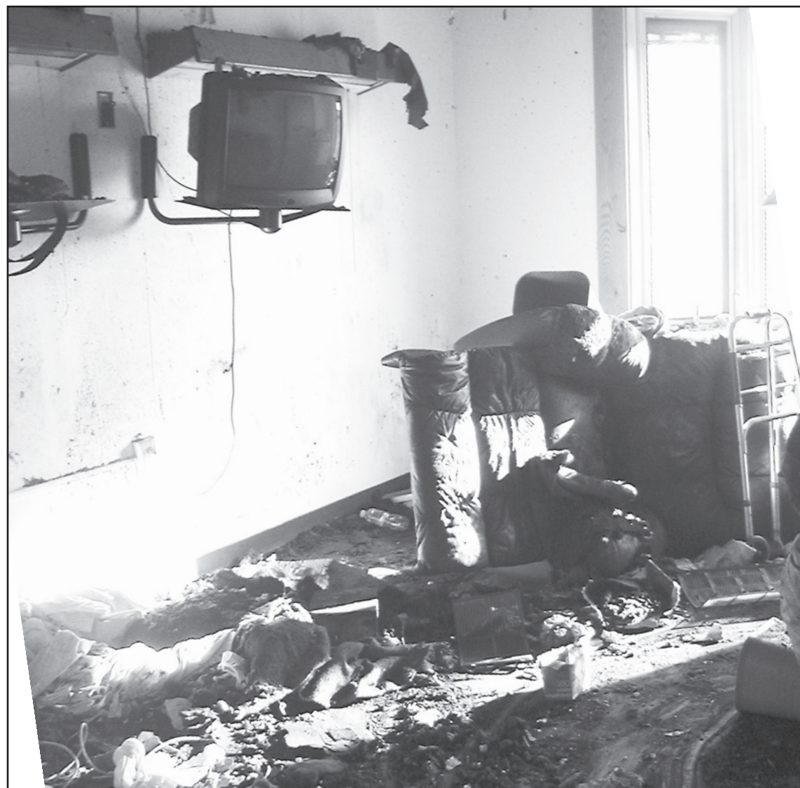
FIRE AT THE GOOD SAMARITAN VILLAGE on Oct. 19 left parts of the middle section in shambles. Now, that is behind as the Society begins rebuilding.

Phase one, he said, is expected to be completed by March 1. In phase two, the center plans to finish 10 more units for a total of 32 by May 1. Decisions have not been made for plans after phase two.