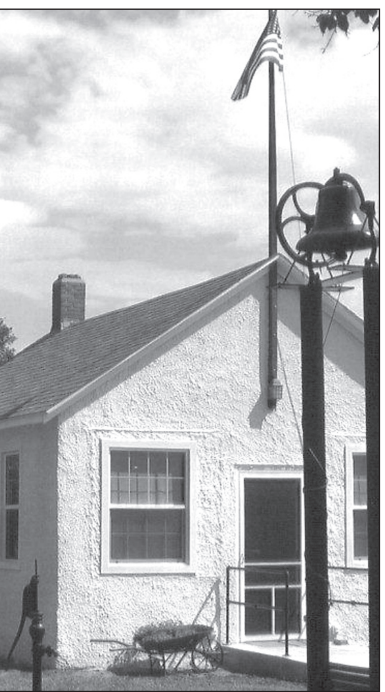
HAIGLER CORNERSTONE MUSEUM will open during the Fall festival. The picture above is after the restoration of the schoolhouse. Below and to the left is a picture before the school was moved.