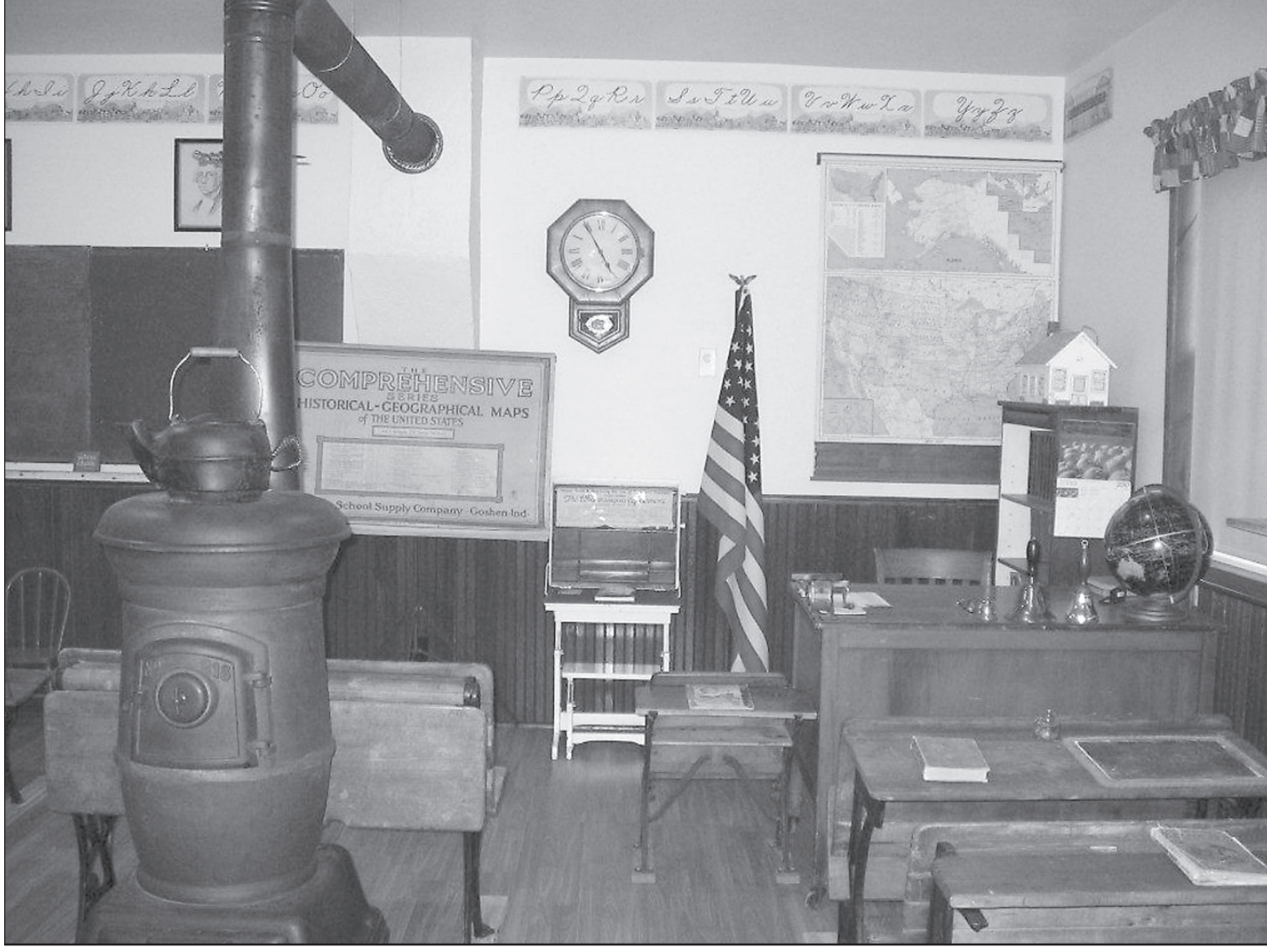
INSIDE the Country Schoolhouse it looks as it did back in the early 1900s.