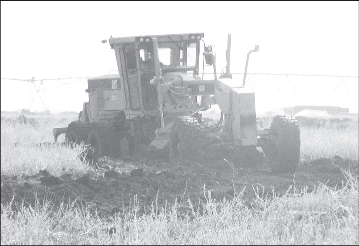
SCRAPING BACK THE topsoil — work has started on the site of the Bird City Dairy.