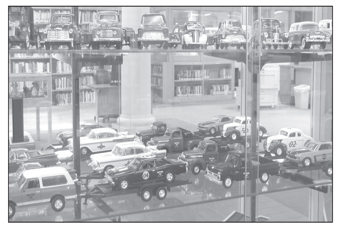
Bill Beale's collection of miniature vehicles is one of the new displays at the Norton Public Library.