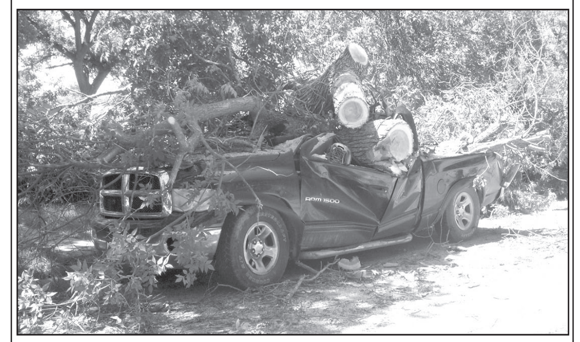
Late Saturday night in Almena strong winds and possibly a tornado caused widespread damage and power outages across town. Trees fell on homes, smashed numerous vehicles, and made streets impassible until cleanup began.