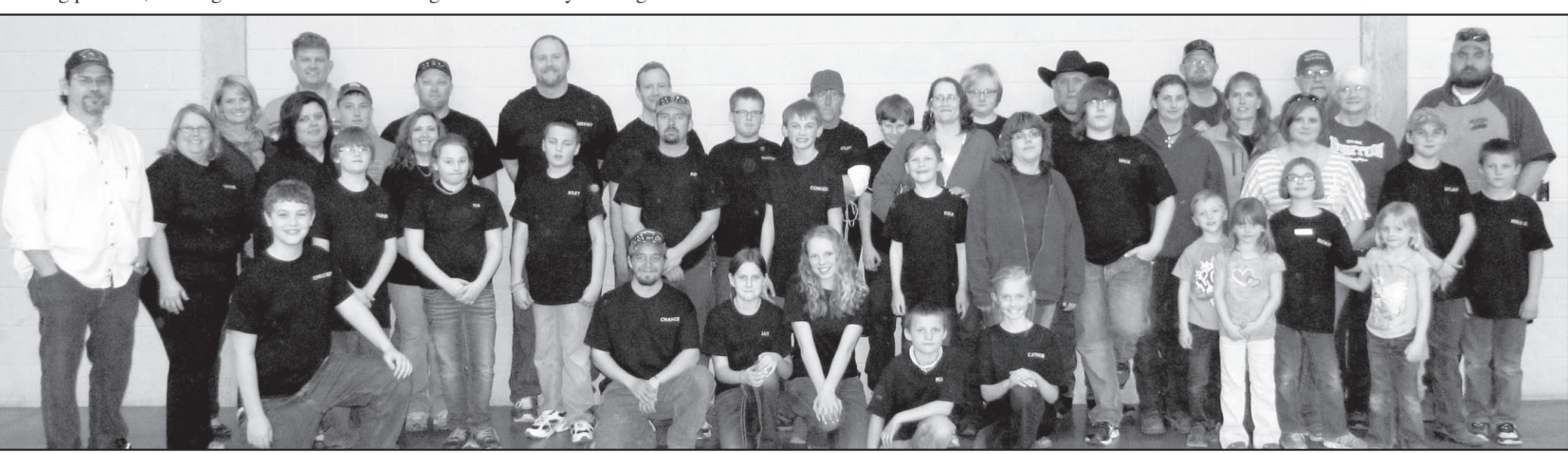
NORTON COUNTY BB GUN FANS ARE THE BEST! Whenever a BB Gun Shoot is held, whether state or national, the Norton teams always receive the best fan support. Saturday, March 15 was no exception as another large crowd traveled to Holton where three Norton County Rotary BB Gun Teams competed in the State BB Gun Championships. Pictured are the young marksmen, coaches, parents and fans following the Awards Ceremony.