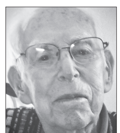
and three great-great-grandchil-

the Norton Fire Department for their quick response Sunday. Also a big thank