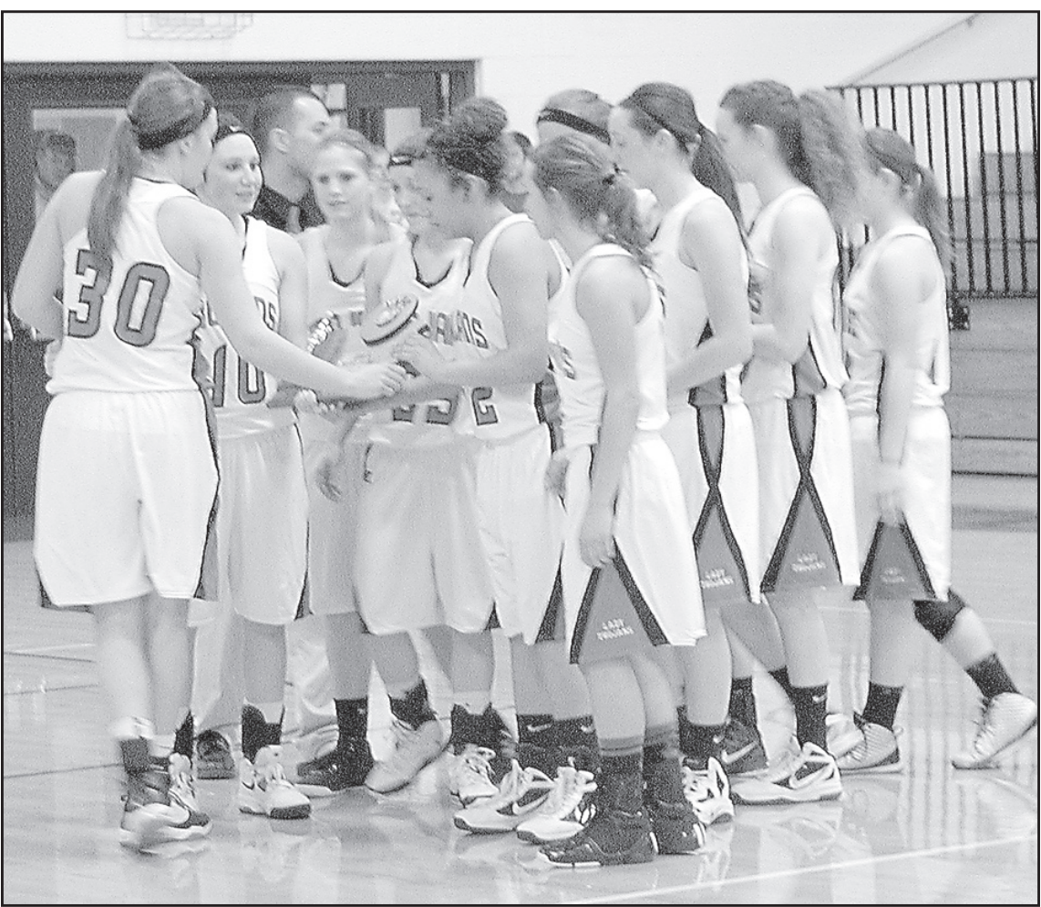
The Logan Lady Trojans won the Sub-State Tournament against Grainfield/Wheatland/Grinnell last Saturday with a 40-39 very close win. This win takes them on to the State Class 1A Division II basketball championships this Thursday at 3 p.m. in Hays.

In Class 3A at the Hutchinson Sports Arena, the No.7 seeded Holcomb girls (17-6) will play No. 2 seeded Burlington (22-1) at 3 p.m. on Thursday and the