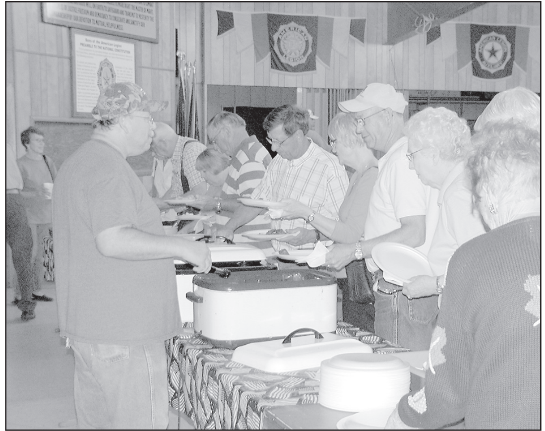
The American Legion held the annual membership drive on Monday. Fish, rocky mountain oysters and frog legs were served, along with many other tasty dishes. As seen here, several people stood in line waiting for their plate full of wonderful food.