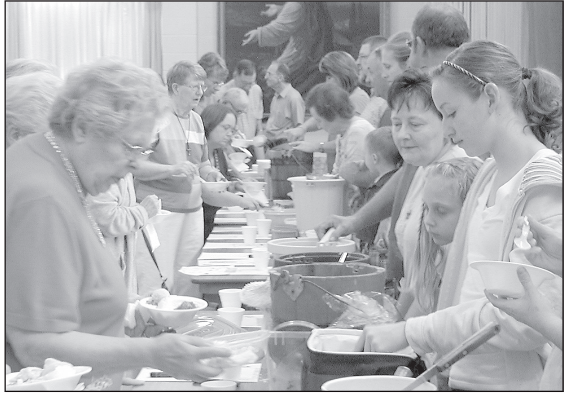
The First United Methodist Church of Norton held an Ice Cream Churn Off Sunday. The event was sponsored by the pastor, staff, parish and the Committee for Missions and Ministries. Prizes were given for the best ice cream made. After the competition, the public was invited to eat their fill. Many turned out to partake of 20 homemade cold treats and fresh baked cookies.