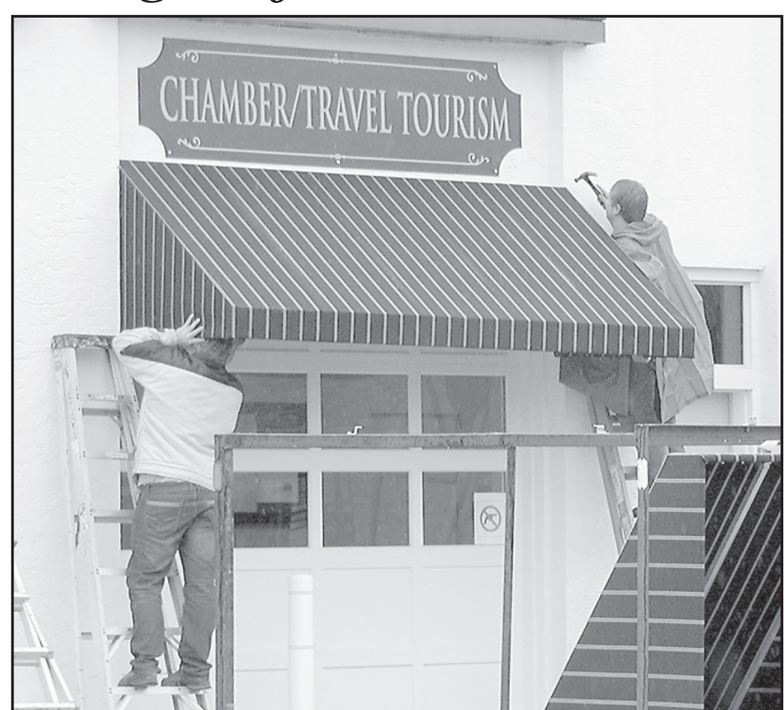
After this summer's relocation of the Norton Area Chamber of Commerce and Norton City/County Economic Development offices, the building on the corner of State and Washington Streets was painted and signs and awnings were being installed on the building Thursday morning.