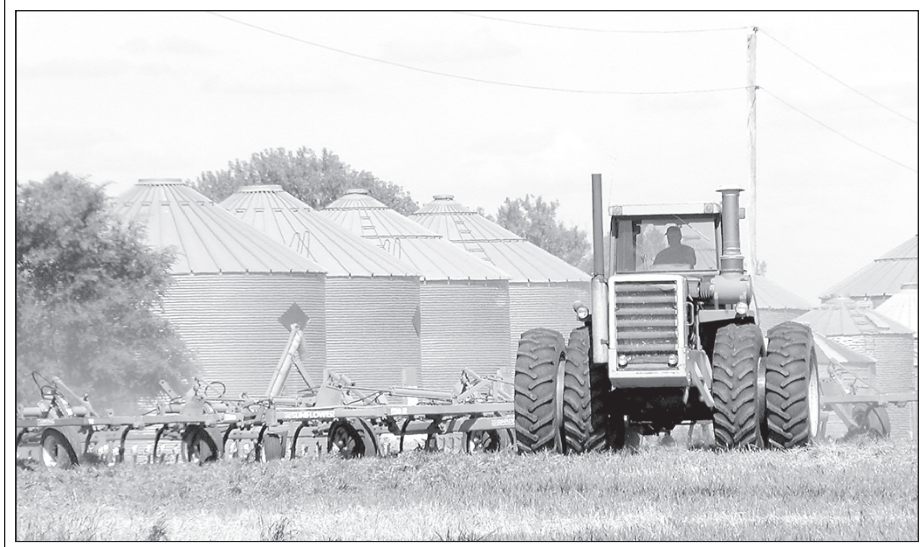
Kem Kindall helps on his father's farm south of Norton Friday afternoon by getting the earth tilled in preparation to plant the winter wheat crop for next year's harvest. Another season of harvest and planting is around the corner as farmers around the area prepare to harvest corn and beans and sow another crop of wheat.