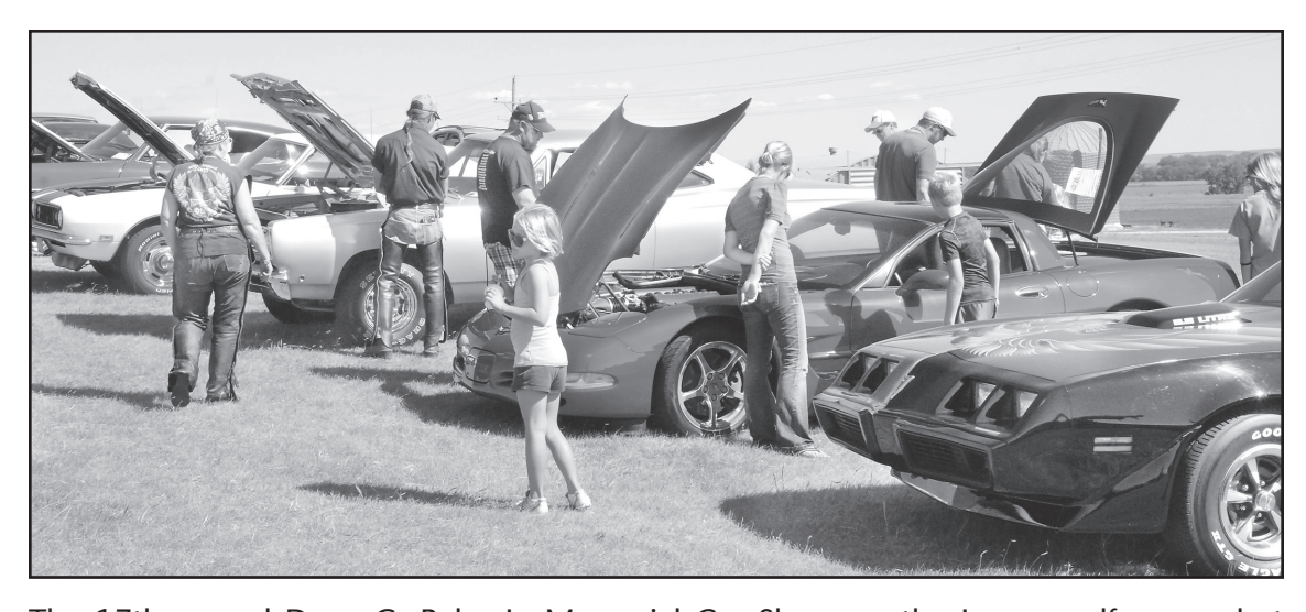
The 17th annual Dane G. Bales Jr. Memorial Car Show on the Logan golf course last Sunday attracted a wide variety of vehicles which were viewed by the large crowd. There were 42 vehicles of all shapes, sizes and vintage.

All in all, it was another tremendous Labor Day celebration in Logan!