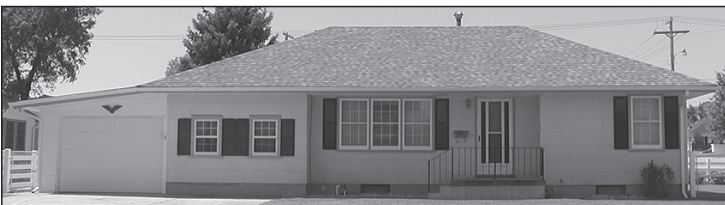
710 N. Wabash

Main Floor has 2 bedrooms and bath, living room, small eat-in kitchen; Finished Basement with rec room, 2 bedrooms and utility room with shower. Central heat and air, large finished patio and sprinkler system; single car attached garage.