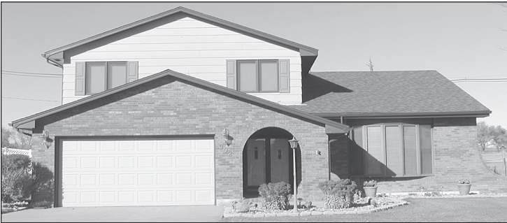
902 Valley Drive

Over 3,000 sq. ft., 3 large bedrooms with 2 1/2 bath, utility room on main floor. Basement with finished rec room, den and fourth bedroom; kitchen with stainless steel appliances, 2 car attached garage, central heat and air, patio deck off kitchen and family room, large double lot with custom built shed for mower and tools.