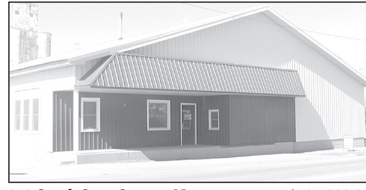
212 South State Street - Norton..... $125,000.00 BUSINESS BUILDING