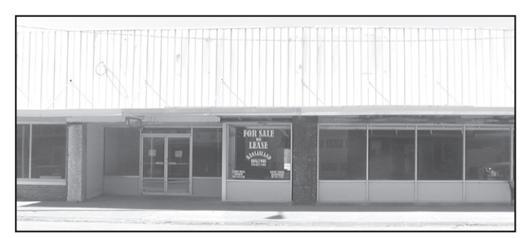
112 State Street - Norton ...... $150,000.00 FOR SALE OR LEASE