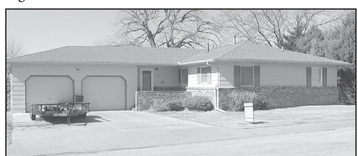
606 Sunset Drive - Norton ..... $75,000.00 2 bedrooms, 2 baths on main floor, 2 bedrooms, 1 bath, family room in basement, double car attached garage