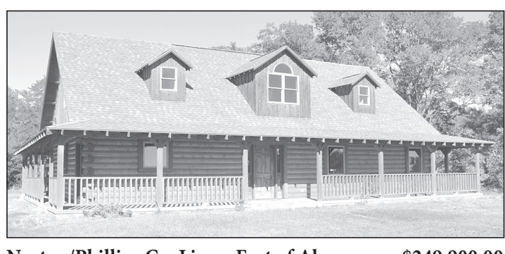
Norton/Phillips Co. Line – East of Almena . . . $249,900.00 Log cabin home, 12 acres, large wrap around porch, large great room with fireplace, eat-in kitchen with all stainless steel appliances and island, master bedroom/ master bath, walk-in cedar lined closet, utility room, half bath, loft - 2 bedrooms and bathroom, large unfinished basement, 2 large unfinished rooms, large utility room, bathroom, large 3 car garage.