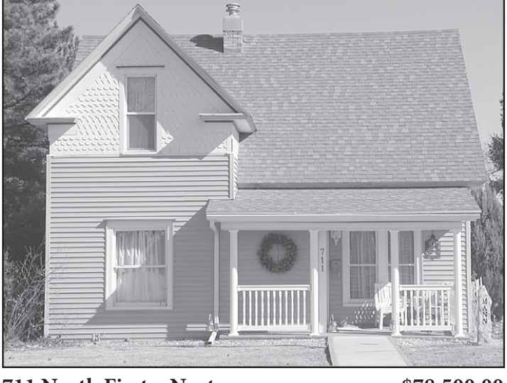
711 North First - Norton ..... $78,500.00 1 bedroom on main floor, 3 upstairs, 2 bathrooms on the main floor, nice kitchen, living room, dining room, bathroom upstairs, corner lot, nice storage building, double car garage