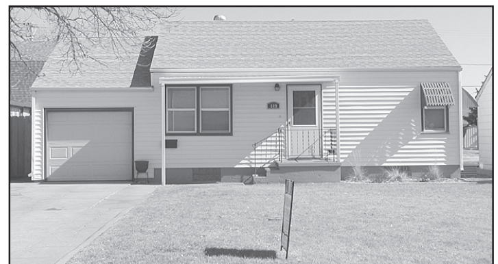
809 North Wabash - Norton . . . . . . . . . . . $68,500.00 Very neat and clean, 2 bedrooms upstairs, living room, kitchen, bathroom downstairs, family room, 2 bedrooms, bathroom is in the utility room, nice vinyl siding, new windows, nice lot