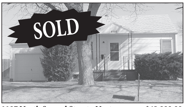
1107 North Second Street - Norton..... $49,000.00 2 bedrooms, 1 bath on main floor, full basement with family room and 1 bedroom, single car attached garage