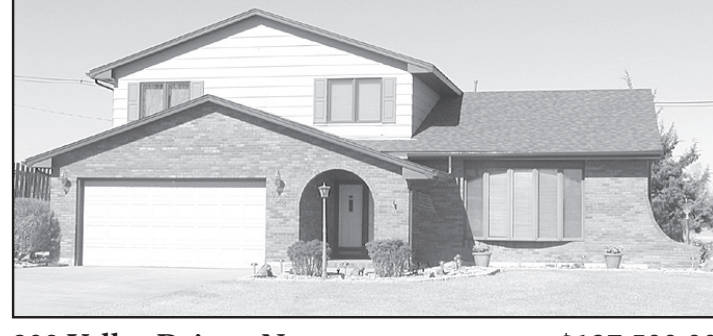
902 Valley Drive - Norton ..... $197,500.00 3 bedrooms, 2 bathrooms on upper level, formal living and half bath on main floor and family room, utility room, basement with game room, 1 bedroom, double car attached garage, large lot, nicely landscaped with utility building.