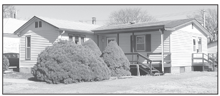
1 bedroom, 1 bathroom main floor, 3 bedrooms, 1 bathroom, large family room and utility room in basement, recently remodeled, double car detached garage