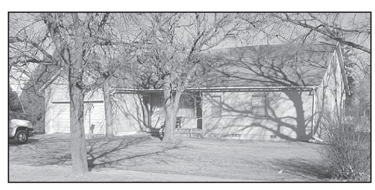
420 South Main Street - Lenora. . . . . . . . . $68,500.00 3 bedrooms, living room, bathroom and utility room on main level. Full basement with a large family room, bedroom and storage. Oversized single car garage, covered patio on a nice large lot.