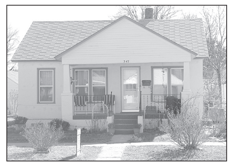
342 West Lincoln - Norton..... $45,000.00 2 bedrooms, 1 bath, double car detached garage