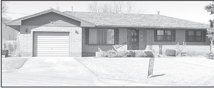
1102 Nixon Drive - Norton ..... $150,000.00 Brick home, 3 bedrooms, large bathroom, nice kitchen, living room, dining room, new floor coverings throughout main floor, full basement, 2 bedrooms, large family room, bathroom, single car garage, corner lot, very nicely landscaped