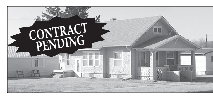
315 South Third Street - Lenora ...... $62,500.00