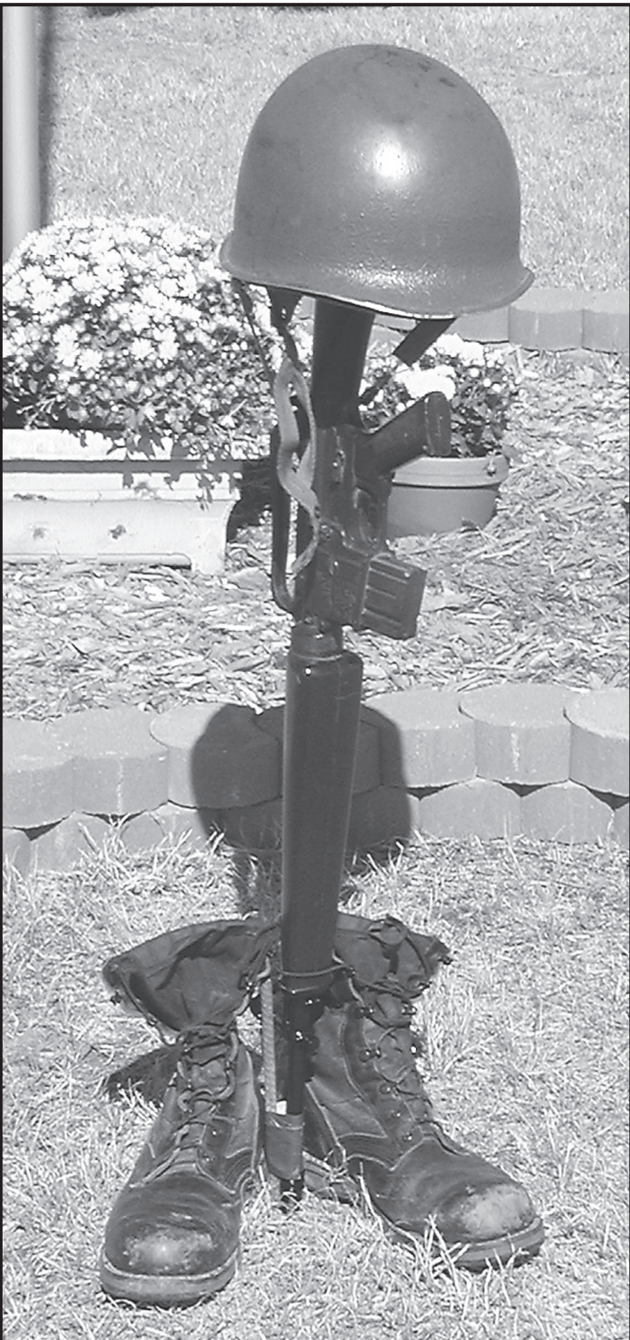
The Vietnam Memorial Moving Wall is in Norton for the rest of this week. This is the culmination of six months of work by many groups and individuals. The wall memorializes those who made the ultimate sacrifice to ensure the freedoms we enjoy here in the United States of America. The wall, located on the grounds of Prairie Land Electric, on West Highway 36, has no set hours, but ceremonies are planned each evening at 7. Closing ceremonies are set for Monday at 2 p.m. Stop by any time for contemplation. Then find a vet and thank them.