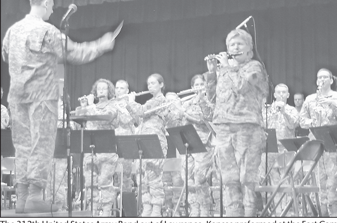
The 312th United States Army Band out of Lawrence, Kansas preformed at the East Campus auditorium last Wednesday night. They were brought here by the Norton County Arts Council as a fund raiser to bring the Vietnam Memorial Moving Wall to Norton in September.