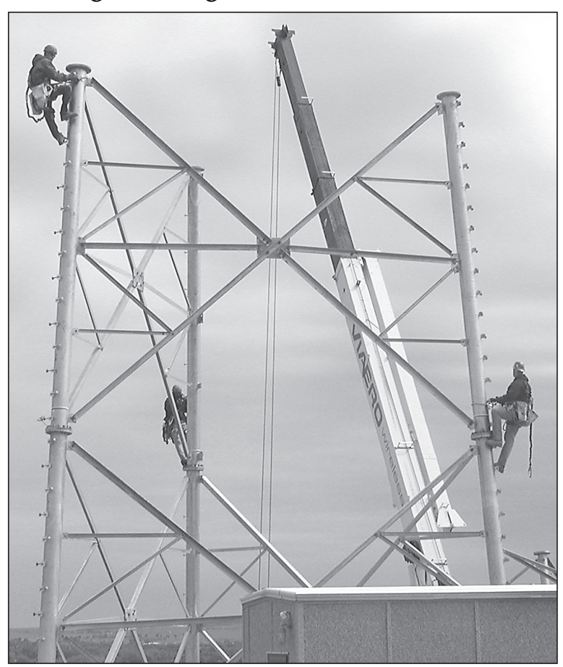
Workers from Vaero Wireless Company, based out of Ft. Morgan, Colo., continued work on a tower south of Norton. They hope to be done with the project sometime next week.