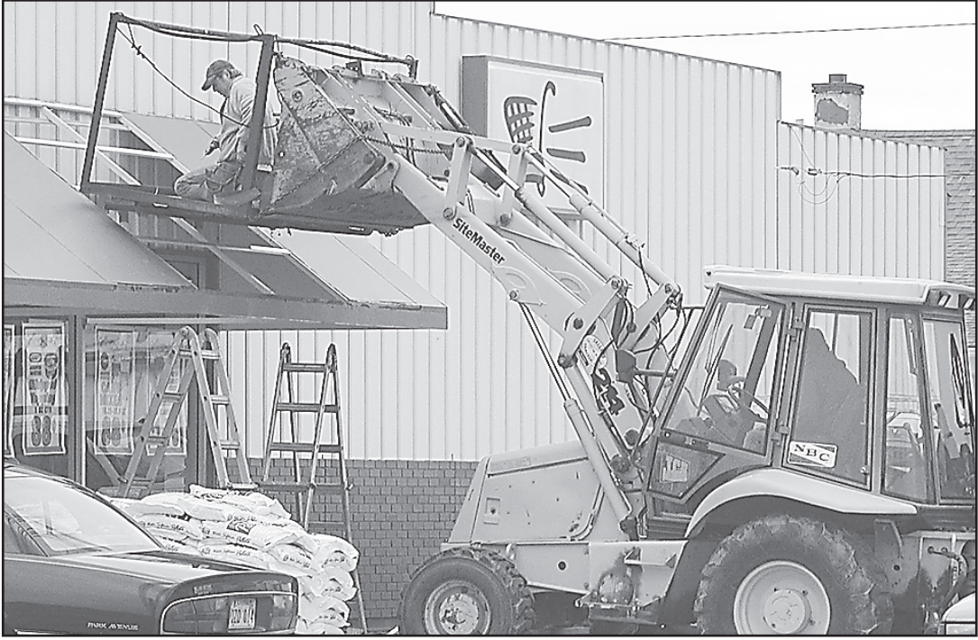
Jamboree has been in the process of getting a face-lift during the last week. Work continued Monday with the awning being taken down. Nelson Brothers Construction is doing the work.