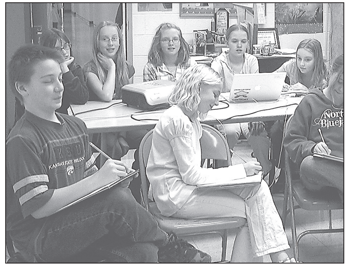
Eisenhower Elementary 5th graders participated in the Thinking Cap Quiz Bowl last Tuesday. The students, who worked together as a group to answer the questions, got 94% correct and received 1137 points. The score will be called in to lowa and then the students will know where they stand in the state and the nation, based on their scores.

The family suggests memorials be directed to the Burley First Presbyterian Church, The Huntsman Cancer Center, the Alzheimer's Association or to a charity of choice.