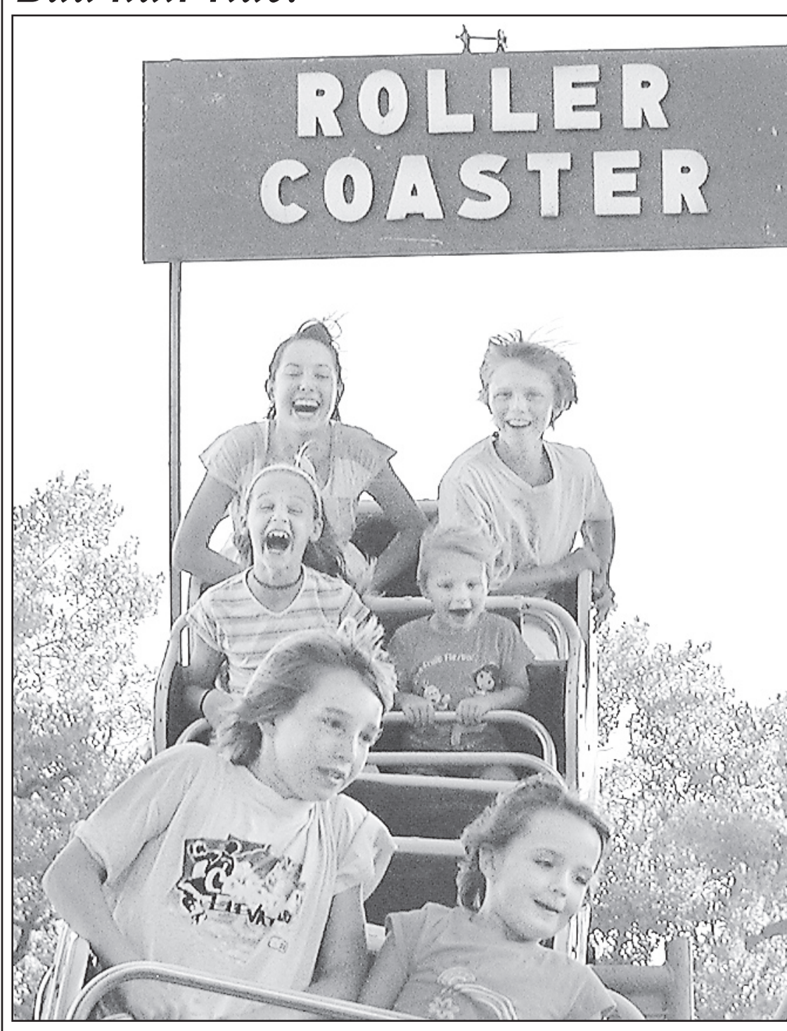
They rode just for the thrill of it, although it turned out not to be a friendly hair ride. But the kids at the Norton County Fair didn't worry about that. They wanted more and more.