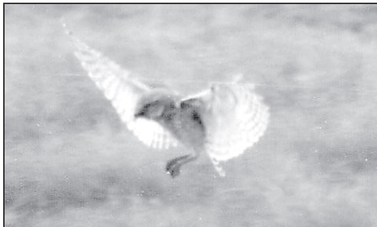
Mama Burrowing Owl