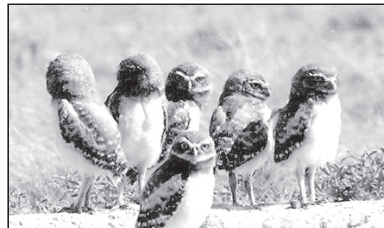
Baby Burrowing Owls