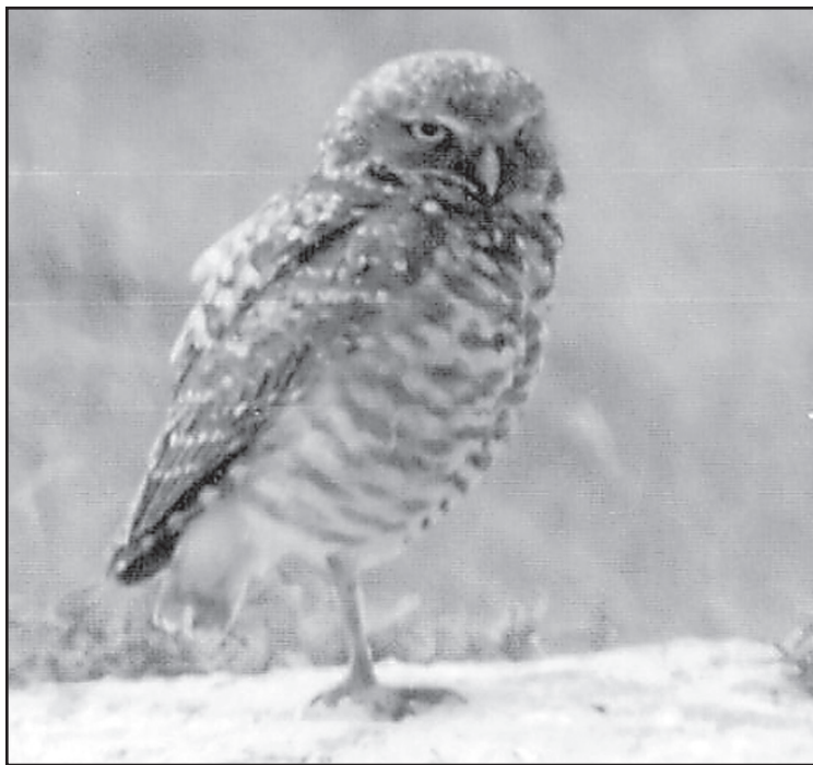
Juvenile Horned Owl