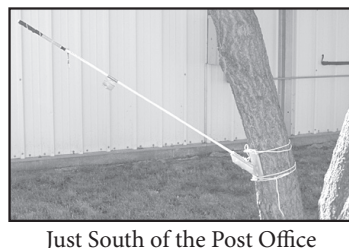
Just South of the Post Office

307 Penn St., Norton, Kansas 67654 • Phone: 785-874-4687