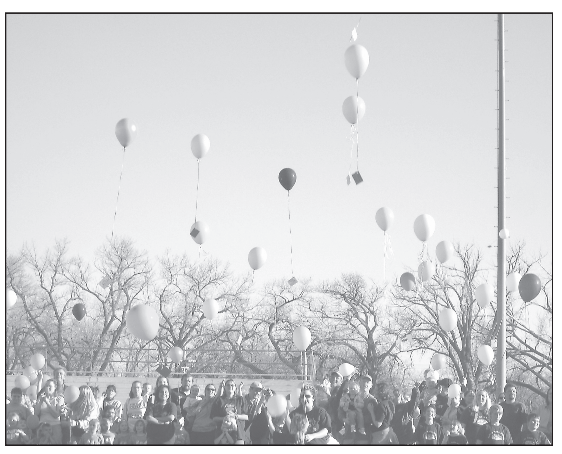
Up, up, and away! Children and adults alike enjoyed the balloon launch during the start of events for the' Week of the Young Child' in Norton.