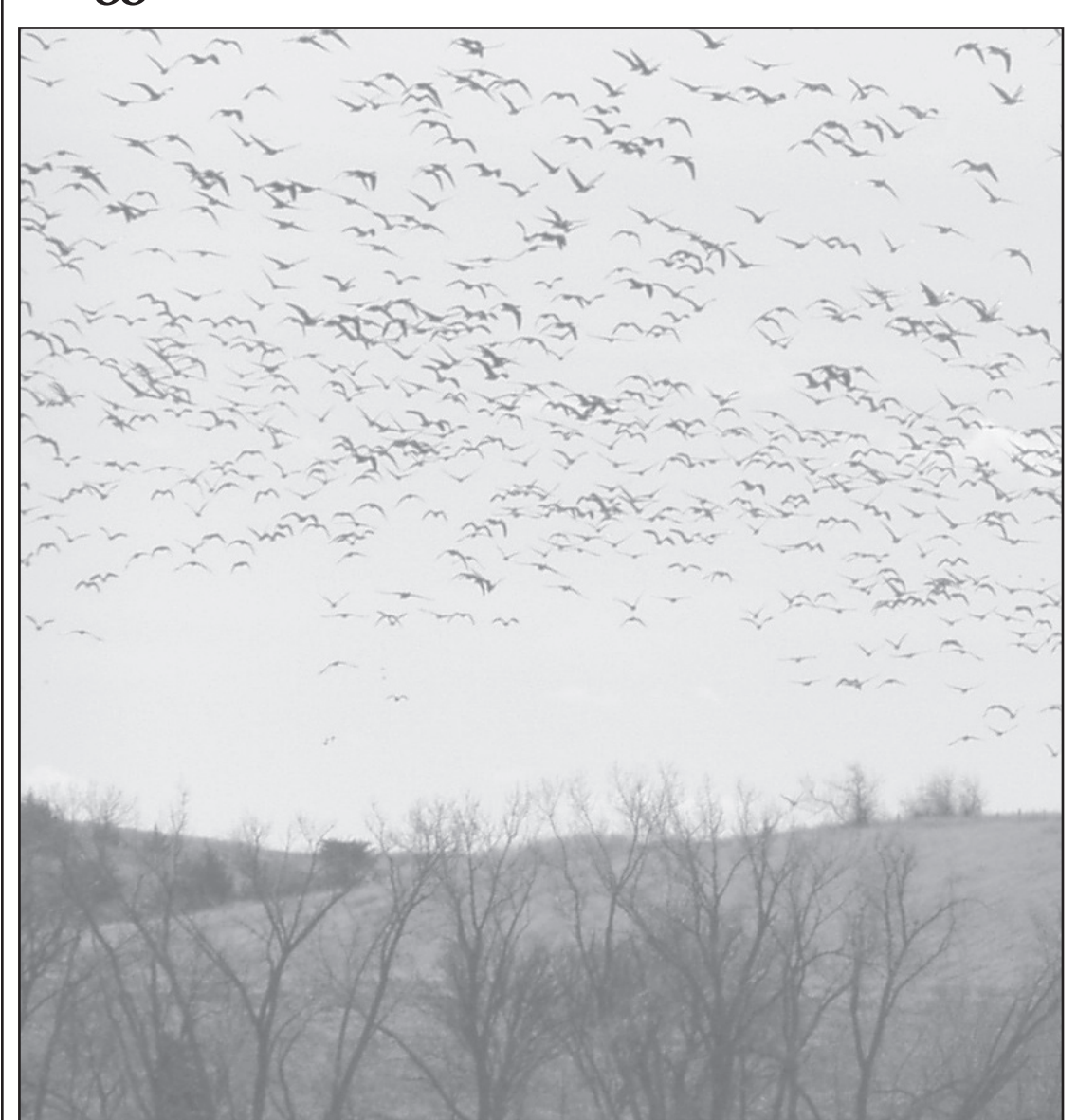
Talk about a gaggle of geese! This was the scene at the Harlan County Reservoir at Alma, Neb., photographed by a Norton Telegram staff member who just happened to be there when this photo opportunity presented itself. In this case, the photo is worth 1000 words.