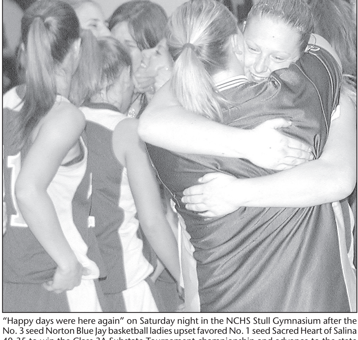
No. 3 seed Norton Blue lay basketball ladies upset favored No. 1 seed Sacred Heart of Salina 40-35 to win the Class 3A Substate Tournament championship and advance to the state tourney in Hutchinson this week. There was a whole lot of hugging going on until the announcer cleared the floor for the awards presentation.