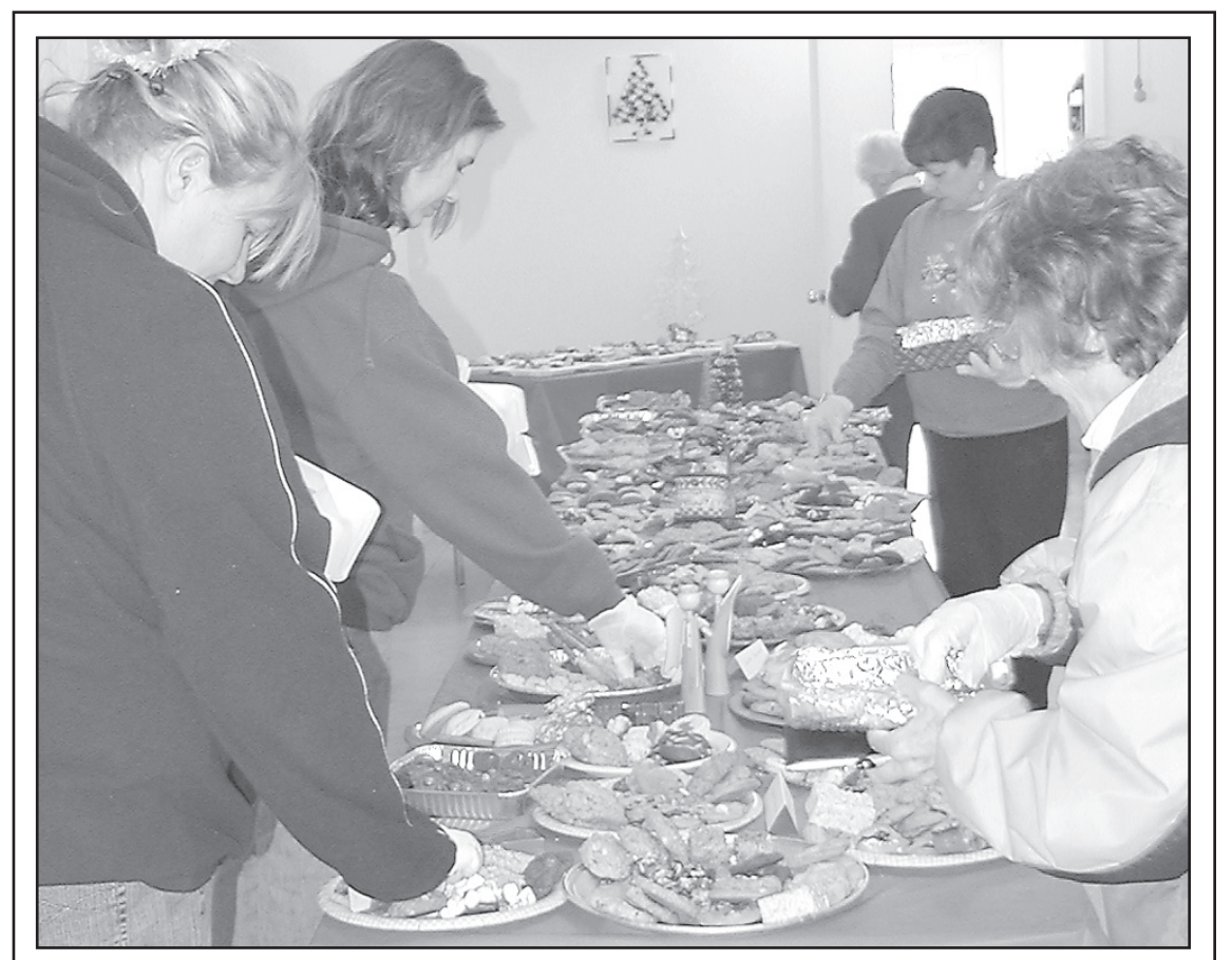
Shoppers at the Cookie/Candy Walk, sponsored by the United Methodist Women, selected from a wide array of confectionery treats. The sweets were paid for by the pound.