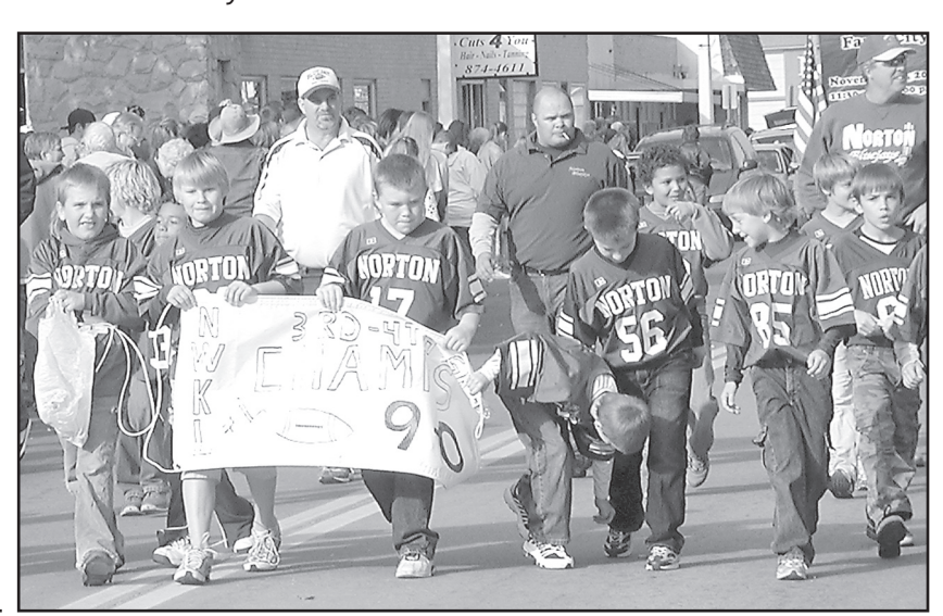
Proud of their undefeated season, the Norton third and fourth grade football team marched in the parade.