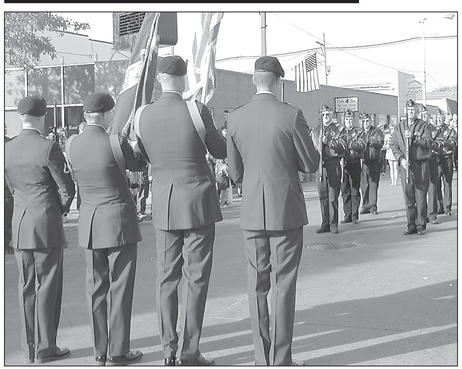
The American Legion color guard stood at attention as the firing squad took their place for a salute to the memory of their fallen comrades.