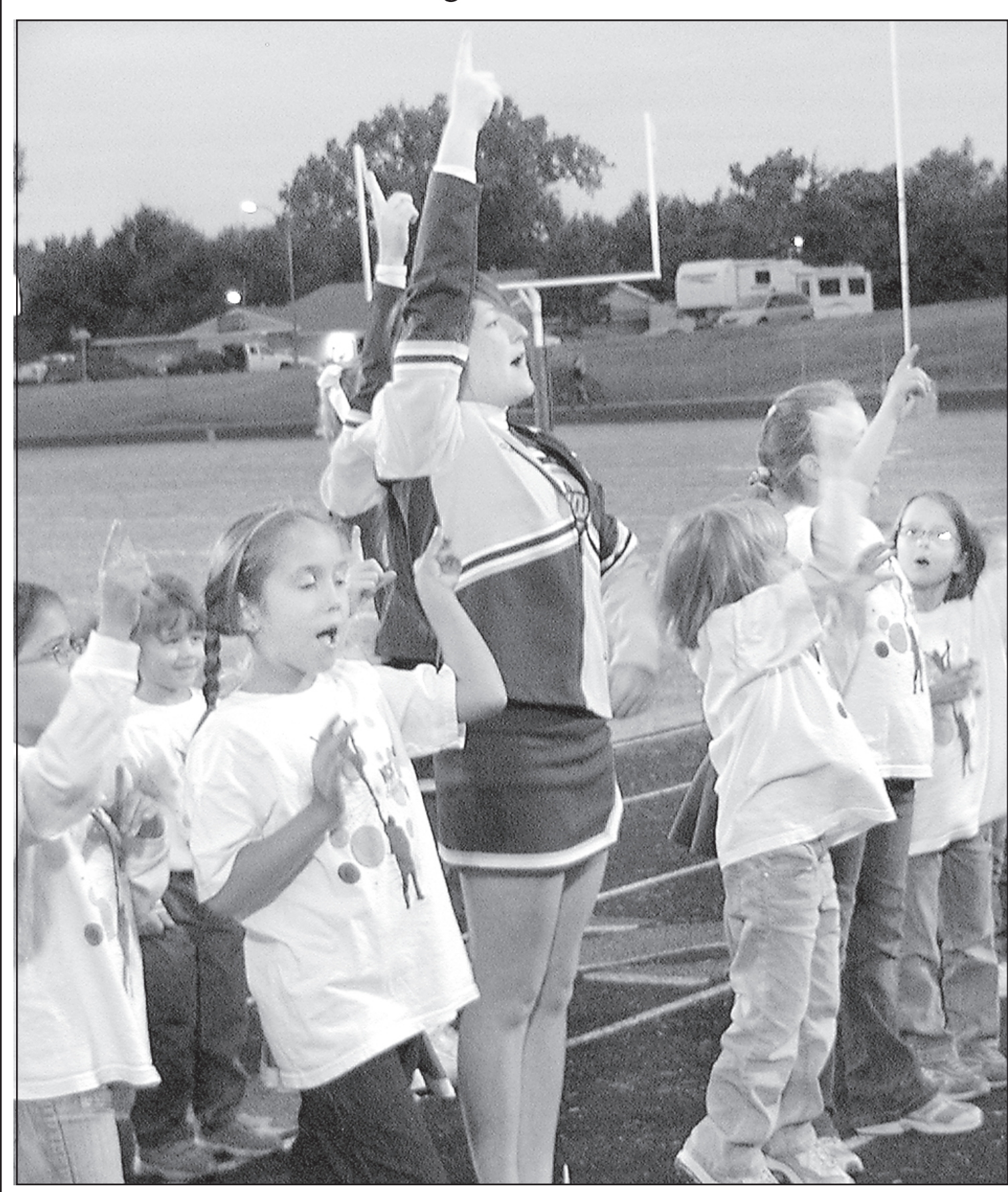
The little cheerleaders who attended the Norton Cheer football game. The girls performed their numbers during Camp this summer helped out their older 'sisters', the thefirst half of the game, helping to get the crowd excited. Norton Cheerleading Squad, at Friday's Norton/Plainville