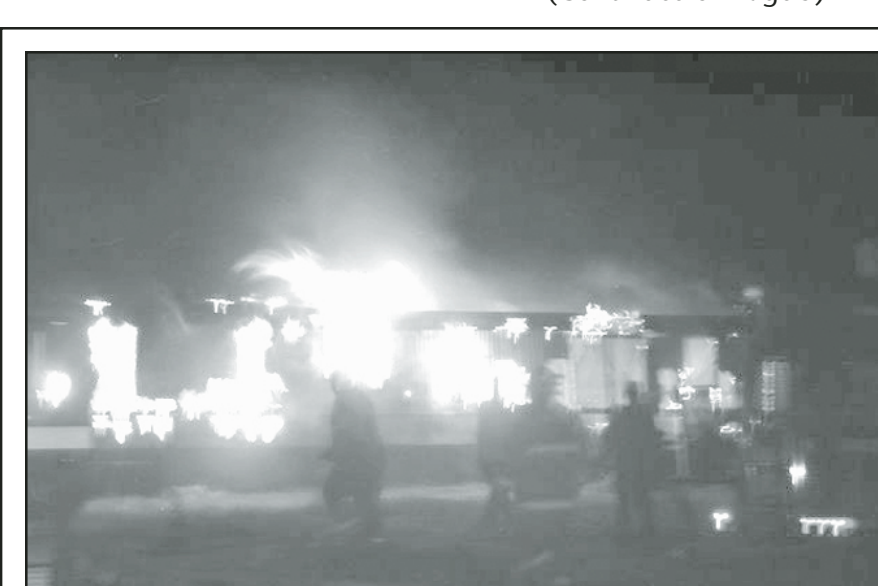
Norton volunteer firemen fought for two hours to contain a blaze that engulfed a trailer early Saturday morning. — Courtesy photo of Verland Olliff