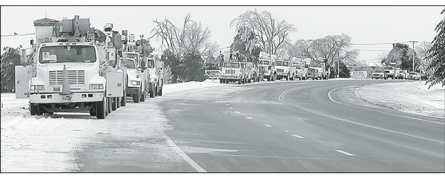
up along US Highway 36 after they rolled into Norton to help