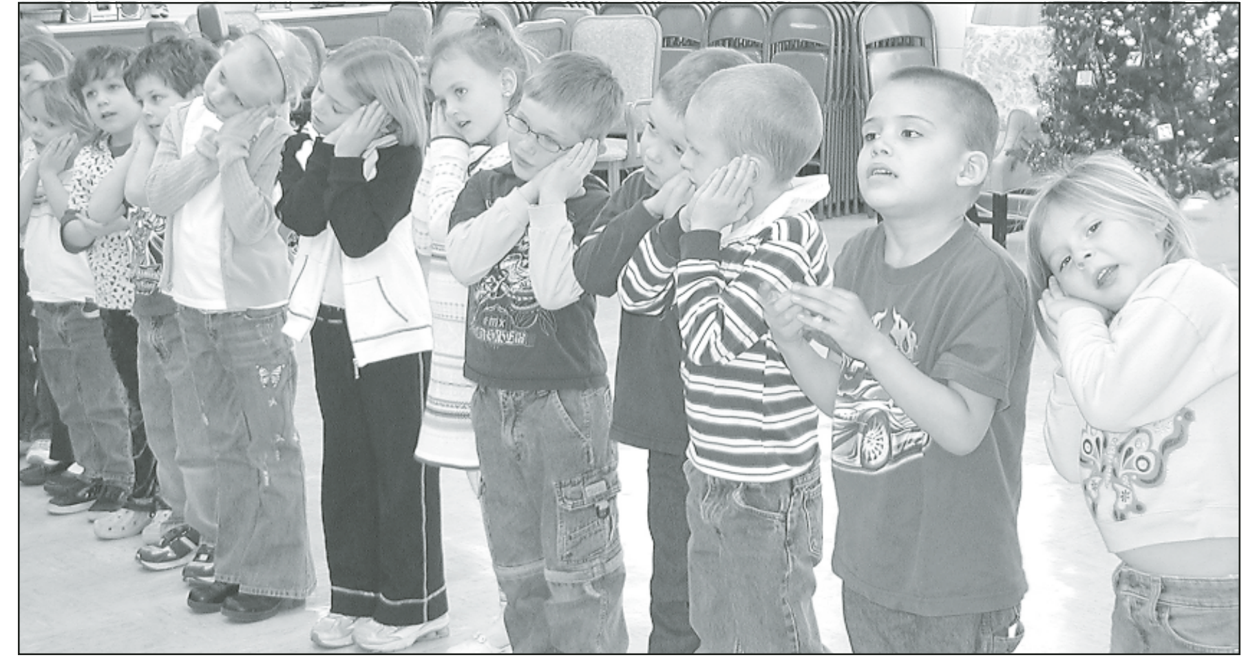
One of the kindergarten classes (above) from Eisenhower Elementary dren acted out the words of "Away In A Manger." They also presented sang Christmas songs for the residents of the Andbe Home. The chil-handmade Christmas cards (below) to the residents.