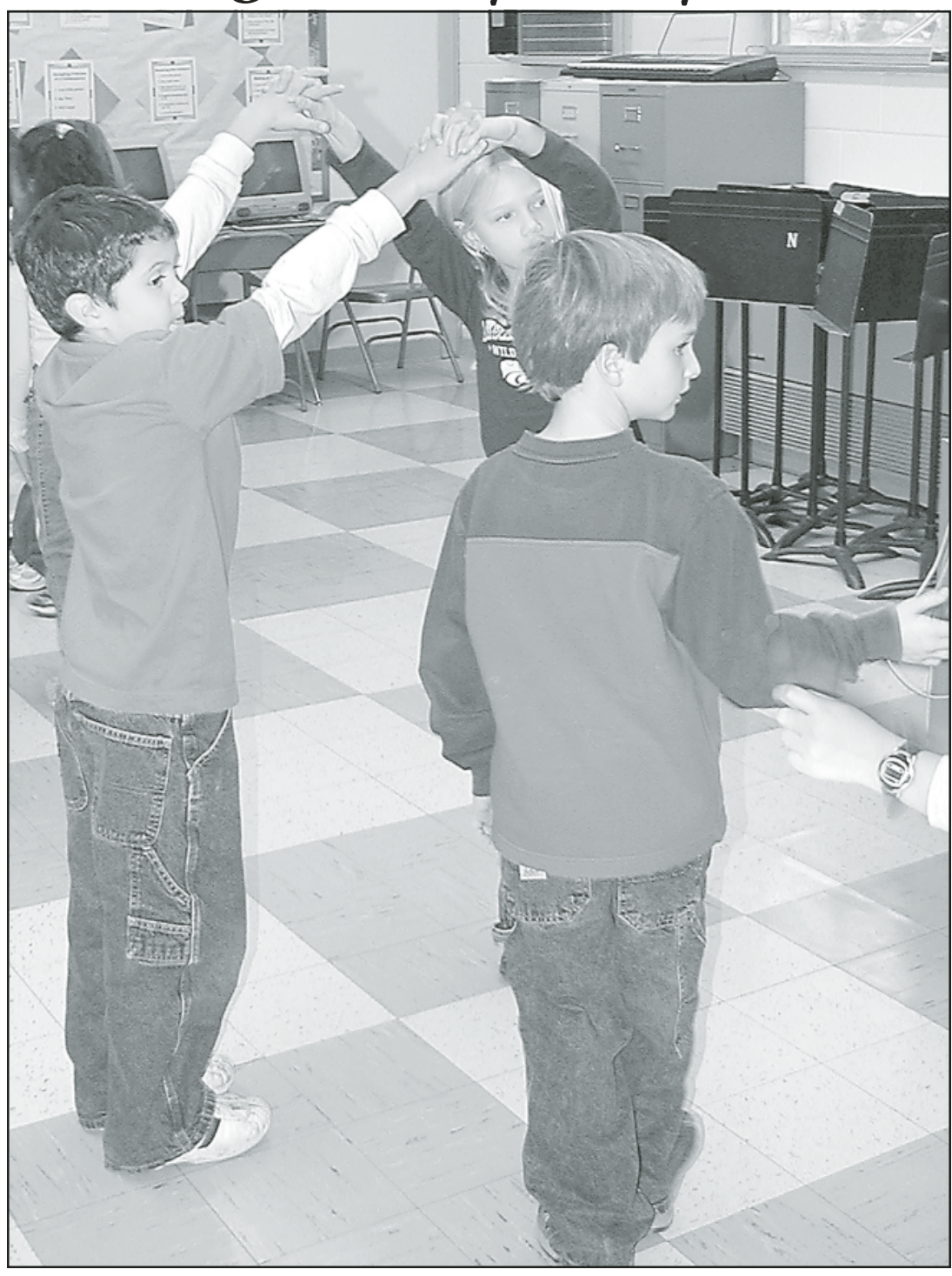
Students practiced dancing and singing during Mrs. Morell's music class at Eisenhower Elementary.