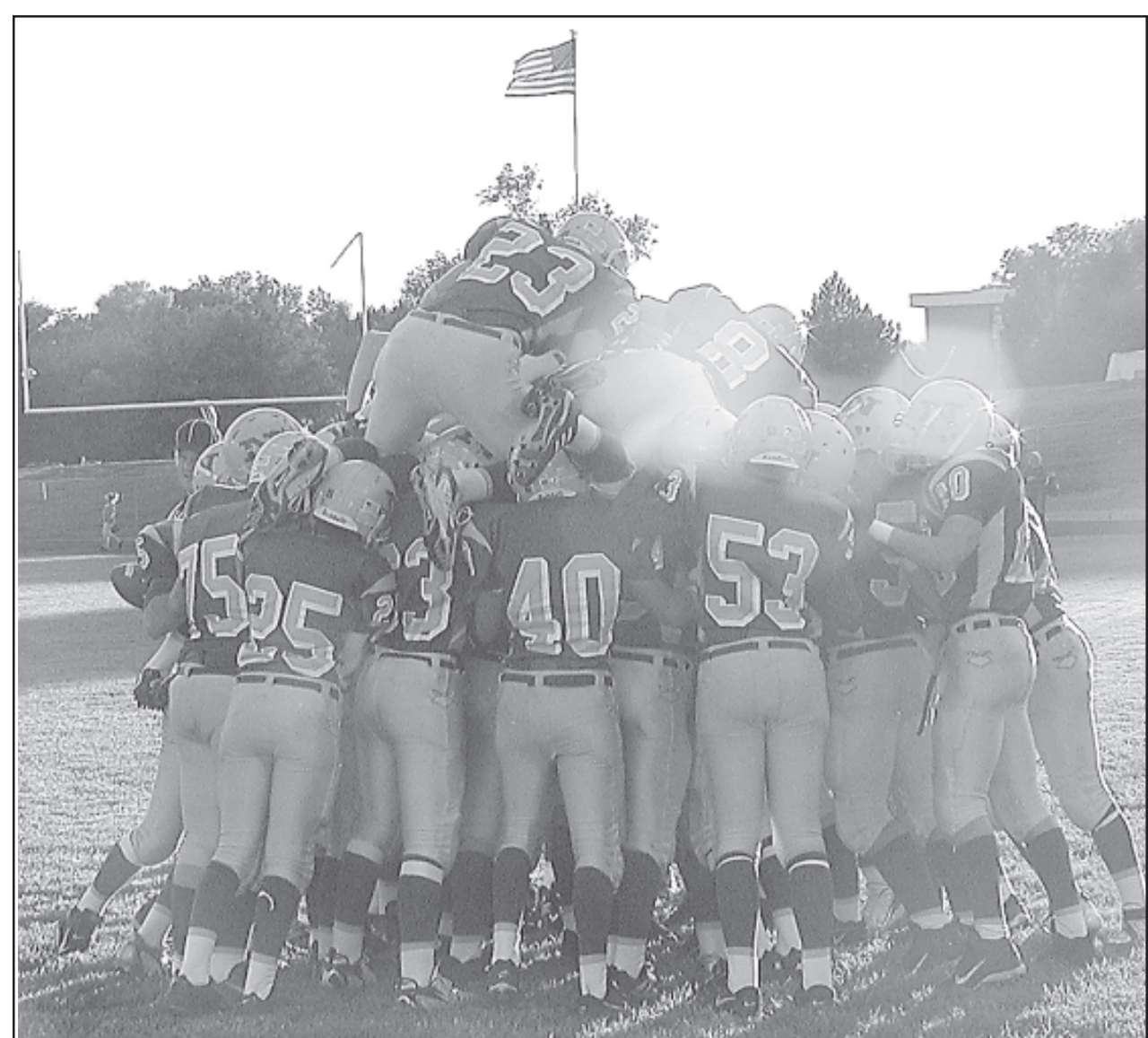
The Norton "troops were ready for battle" as they jumped into one big huddle on the sidelines, fired up and ready to defeat Hill City in the homecoming football game on Friday night.