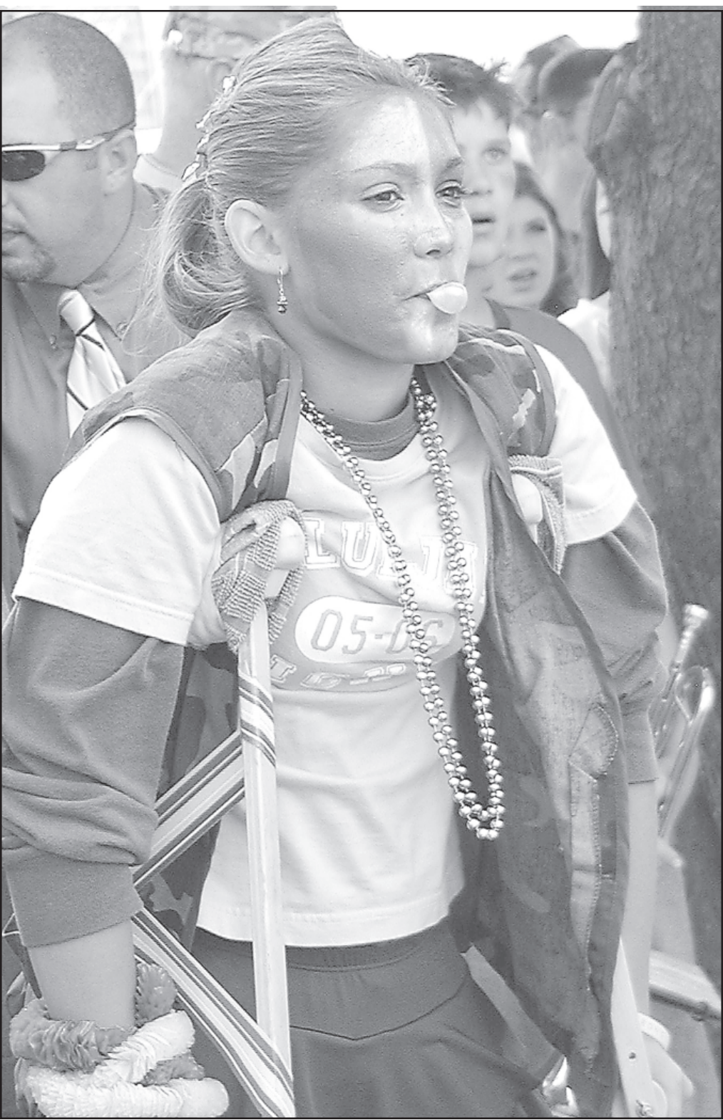
A bubble-blowing Blue Jay fan on crutches was still able to show her school spirit at the homecoming pep assembly.