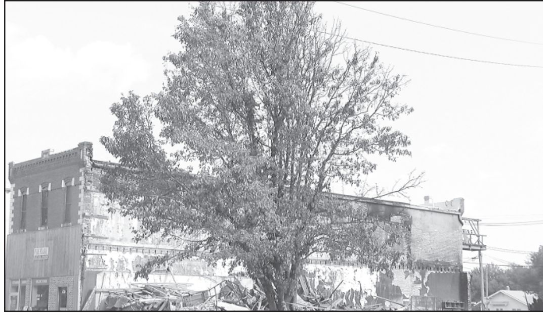
A tree that was half burnt from the fire that took out The Norton Archery Club and U.S. 36 Collectables is greening up again. Hopefully, by next spring, it will be fully restored after its ordeal.