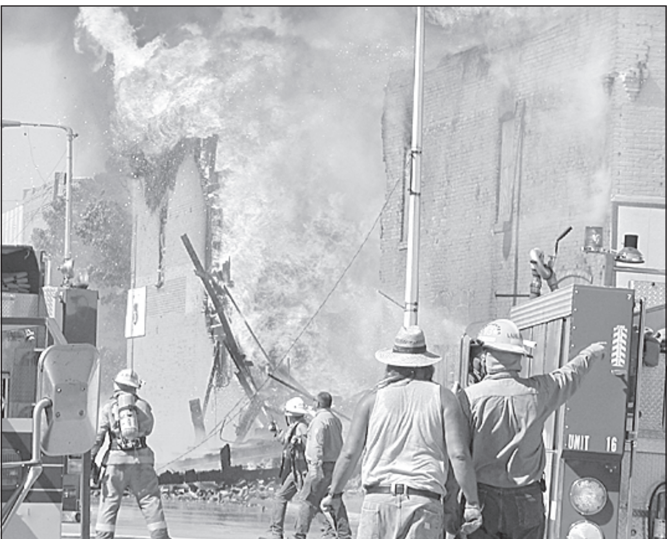
Fire fighters and volunteers watched helplessly as part of the west wall of U.S. 36 Collectables collapsed, showing the interior of the building completely engulfed in flames.