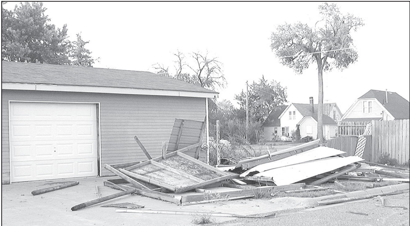
A storm that hit Lenora last night did plenty of damage, making Lenora look "like a war zone," said one resident. A shed at 440 Main St. was just one of the casualties. More information will be available on this storm in Tuesday's edition of The Telegram.

with entry and check-in at 8 a.m. The show will begin with the halter, showmanship and pleasure classes. Entry cards are due in the Extension office by Thursday, July 20. Only two sections per entry are needed. The Ranch Rodeo will beat 7 p.m. Wednesday, July 26; the Jackpot team roping, sponsored by the Norton County Horse Council, will be at 8 p.m. on Thursday, July 27.