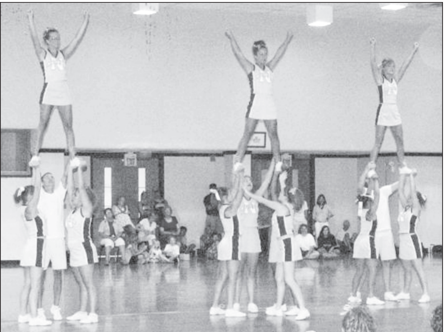
The Norton high school cheerleaders recently attended a four-day summer camp, where they practiced their stunts and earned honors for their work.