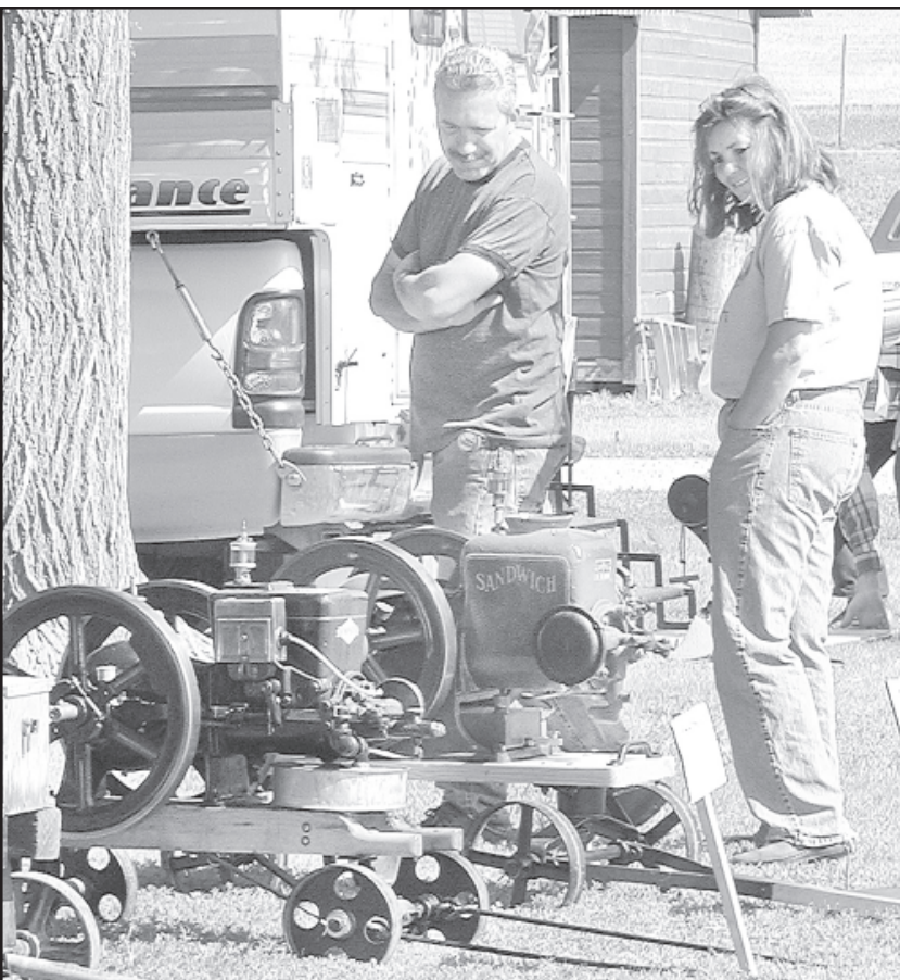
People were able to watch small engines at work.