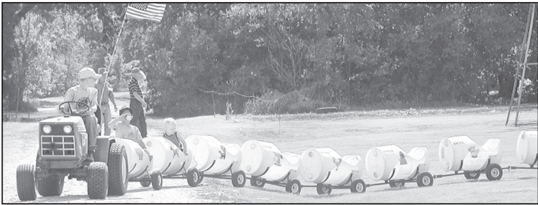
Tyler Montgomery took the kiddies out on a ride in the barrel train.