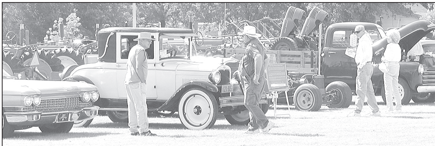
The crowd was able to look at the multitude of antique cars and tractors before the parade.

Donlay advertising all papers 6 x 8 1/2 ad in Gdn