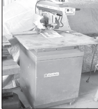
B&D 10" Radial Arm Saw