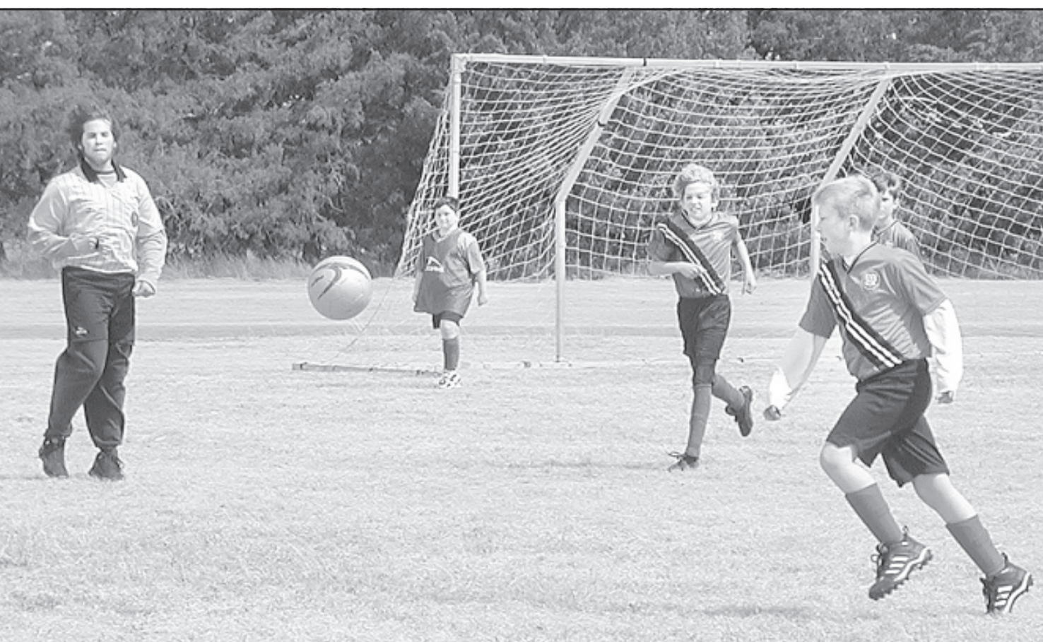
Norton's soccer field was filled with screaming, running children Saturday as it was the first day of games for the American Youth Soccer Organization. Practices have been held for several weeks, but that was the first day where the age-organized teams could compete against each other.