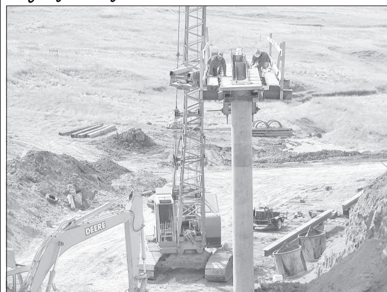
Workmen were perched atop a concrete support pil- This bridge is about two miles east of Norcatur. lar on one of the new bridges being built between the US 36/K-383 intersection and the Decatur County line.