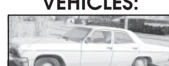
1965 CHEVY BEL AIR — 4 Dr., 6 Cylinder, 3 Speed, 100,655 Miles (Good Body)