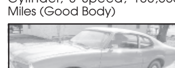
1970 FORD MAVERICK — 2 Dr., 6 Cylinder, Automatic, 33,835 Miles (Good Body, Non Highway Title)