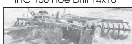
JD 14' Tandem Disc