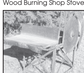
Sears Md #700141 Buzz Saw