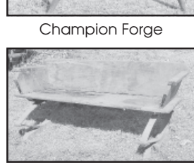
Spring Wagon Seat

Truecraft Rebar Cutter Concrete Tools Drill Bits Wood Planes Hand Saws Gear Pullers Hyd. Jacks (2) Air Compressors 2 T Hydraulic Floor Jack Simo #33 Sickle Grinder Black Smith Hammers Tack Hammers Punches Extension Cords Chisels Nail Bars Wrecking Bars Log Chains Post Drill Crescent Wrenches Allen Wrenches Washers Bolt Assortments Wheel/Tire Balancer Older GE Refrigerator (Works) New Spark Plugs New Bearings Metal Files