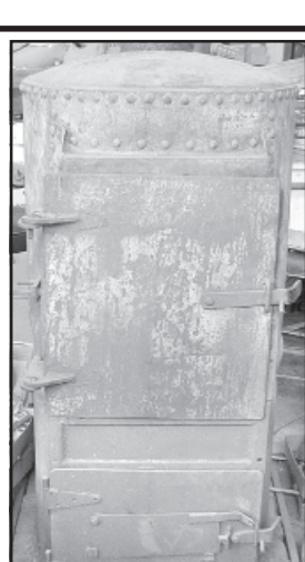
Wood Burning Shop Stove

3/8" Makita Drill Air Drill Skil Belt Sander Sioux Reamer Forney 225 Amp Welder Welding Rod Ridge Reamers Craftsman 1/2" Drill Hones Homelite Chain Saw Chain Saw Sharpener Victor Torch Set w/Gauges and Cart Boomers Victor Aircraft Torch Set Champion Spark Plug Cleaner 4" Bench Vise Battery Charger Pry Bars Battery Tester Valve Tools Electrical Wiring Tools Pliers Ball Peen Hammers Screw Drivers Driver Bits Various Sizes Tin Snips Furniture Clamps Combination Wrenches Open End Wrenches Electrical Wiring Connectors and Supplies Easy Outs Tap and Die Sets Many Shovels, Rakes, Forks, Scoops and Sledge Hammers Electrical and Welding Books Chain Hoist Storage Cabinets Screws Cross Bed Tool Box Nails Endless Drive Belt Bolts Pipe Wrenches Pipe Dogs Pipe Vises Pipe Cutters Snap-on Sockets Drill Press Block and Tackles Craftsman Sockets 1/4" Torque Wrench 3/4" Sockets 1/4" Sockets Spiral Taper Pin Reamer Set (0-5) 18" Drill Bits