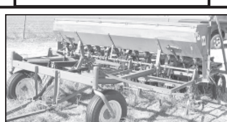
IHC 150 Hoe Drill 14x10"