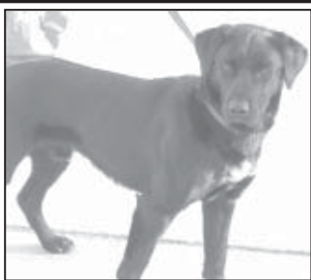
"Toby" - Male Black Lab 1-2 years old

Dogs will be started with obedience training and housebreaking. Vaccinations and spay/neuter will be completed. There will be an adoption fee required for each dog.