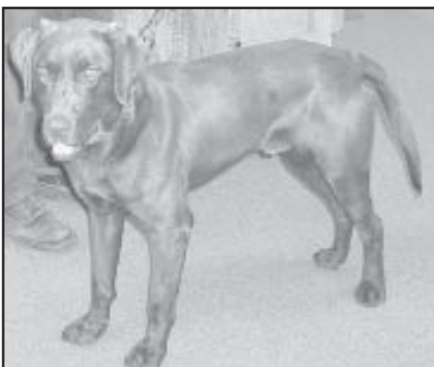
"Chevi" — Male, Chocolate Lab Mix, 1-2 yrs. old

Dogs will be started with obedience training and housebreaking. Vaccinations and spay/neuter will be completed. There will be an adoption fee required for each dog.