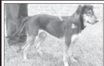
"Madison" - Female Hound Mix, 2 yrs. old

Dogs will be started with obedience training and housebreaking. Vaccinations and spay/neuter will be completed. There will be an adoption fee required for each dog.