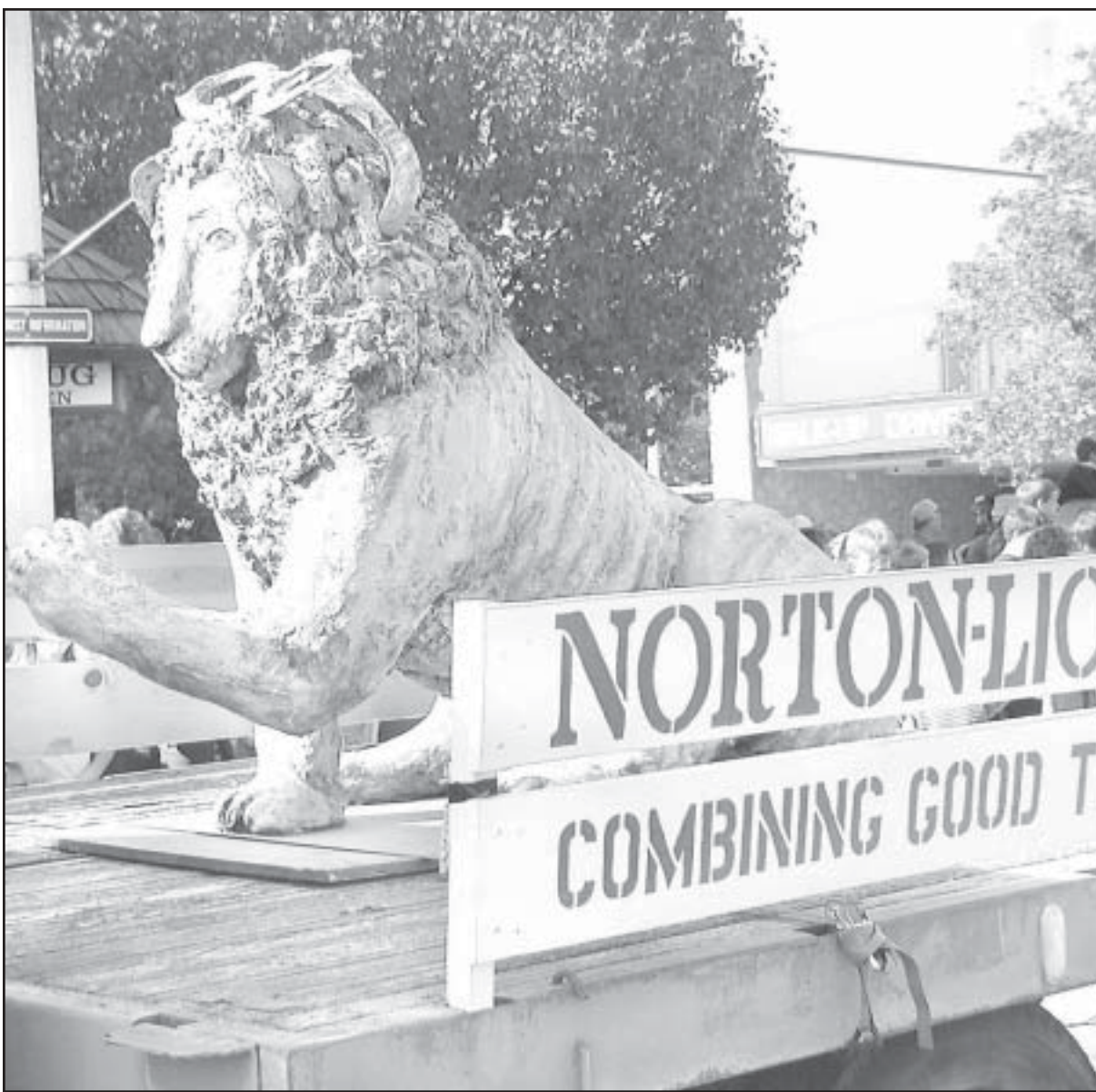
The Norton Lions Club was just one of many floats in the parade.