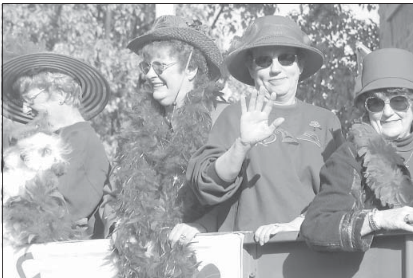
The Crimson Cuties' float was filled with purple and red and lots of frilly, fun stuff as the Norton chapter of the Red Hat Society brightened up Friday's parade.