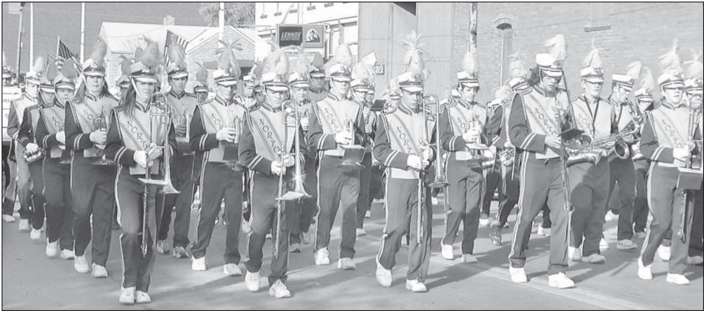
The Norton Community High School band brought the parade to a close, playing "Taps" and other patriotic music during the gun salute and presentation of the colors.