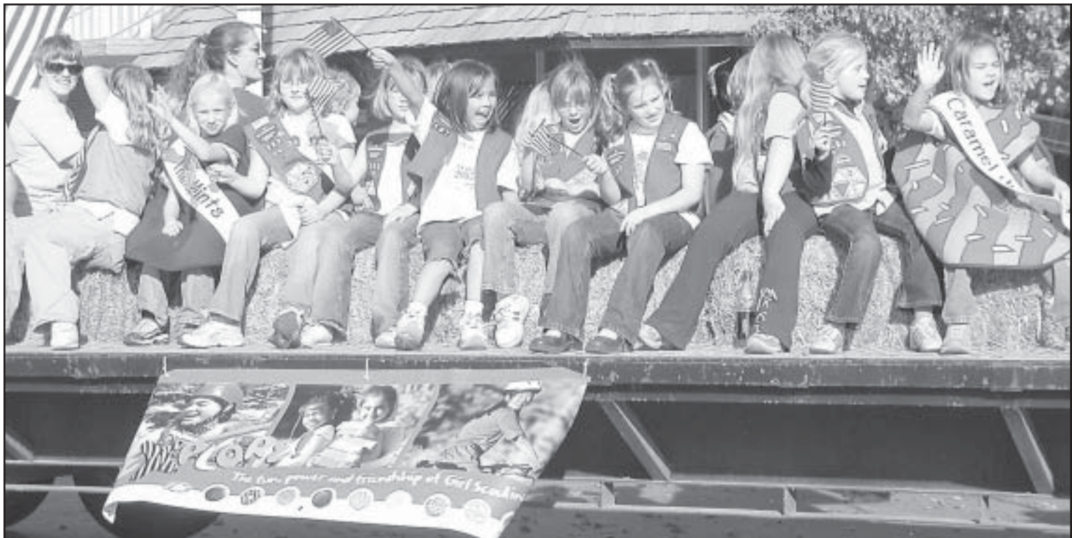
The Norton Girl Scouts and Brownies waved to the Day Parade. Some represented the Scouts' biggest sellers, dressing like the cookies that everybody loves.

Norton Area Chamber of Commerce 109 S. State, Norton, Kansas — Phone 785-877-2501