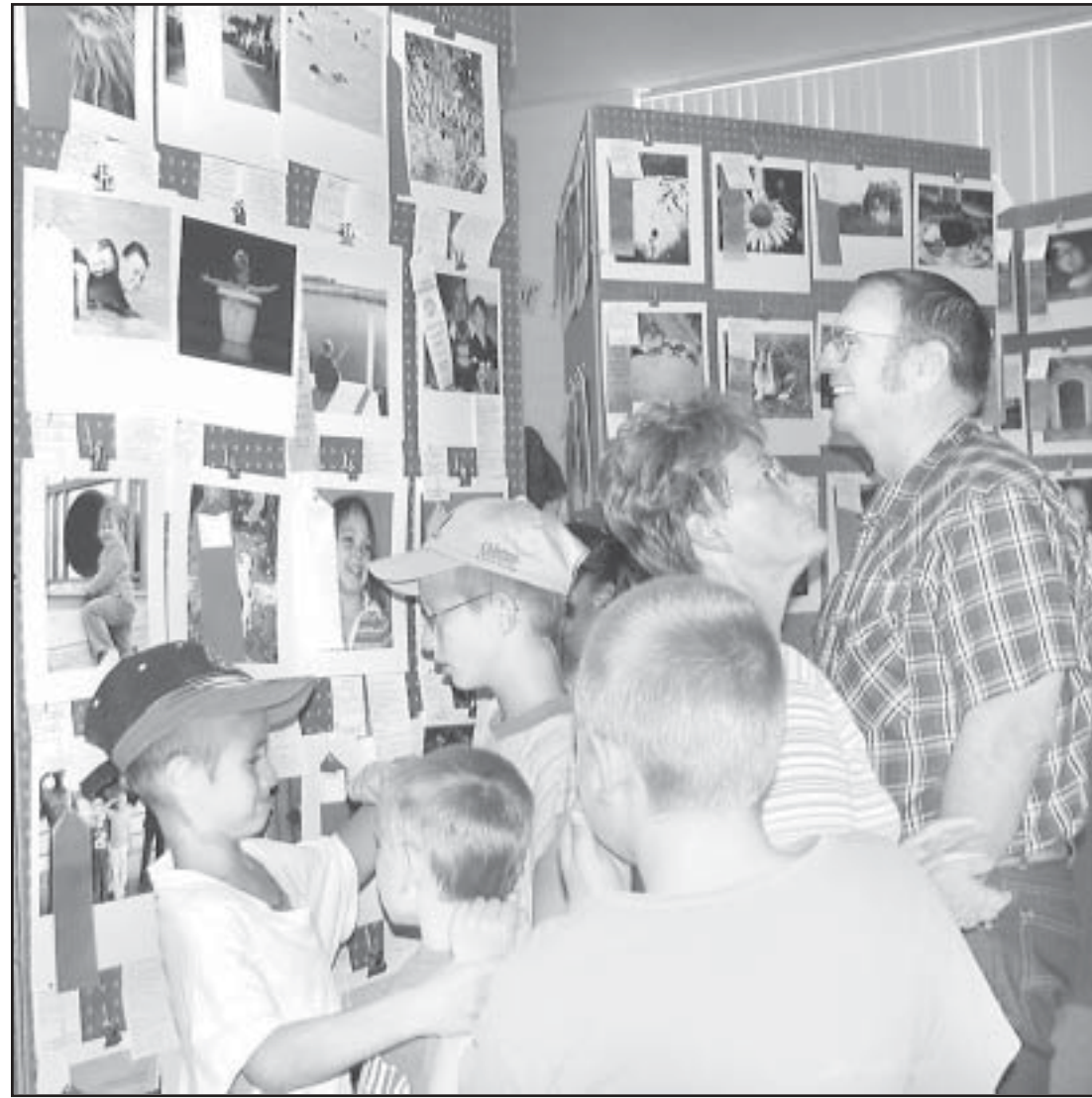
Fairgoers admire the numerous entries in the open class and 4-H Photography contest.