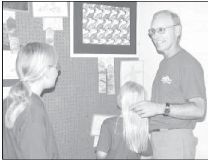
Several people enjoy looking at the artwork on display at the fair.