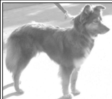
"Honey" - Female Australian Shepherd, 2 years old

Dogs will be started with obedience training and housebreaking. Vaccinations and spay/neuter will be completed. There will be an adoption fee required for each dog.