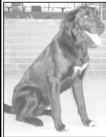
"Gemli" - Male black lab mix, 1-2 years old

Dogs will be started with obedience training and housebreaking. Vaccinations and spay/neuter will be completed. There will be an adoption fee required for each dog.