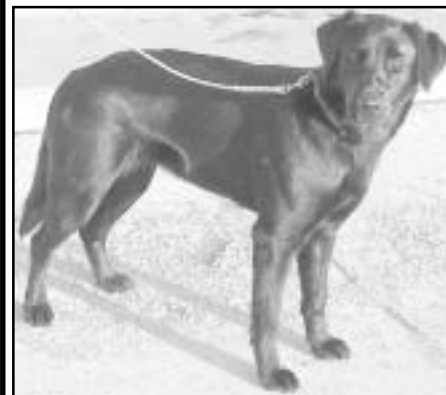
"Sue" - Female Black Lab, 2 years old

Dogs will be started with obedience training and housebreaking. Vaccinations and spay/neuter will be completed. There will be an adoption fee required for each dog.