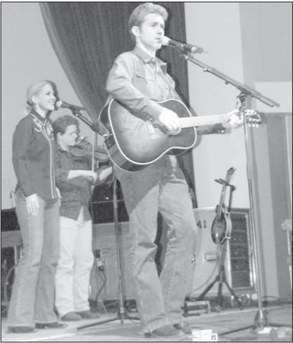
Two fans (right) contemplate buying a T-shirt before the concert began Sunday night. East Campus Auditorium was packed as they awaited the new-comer to country music's appearance on stage. Norton County Arts Council sponsored the singer, best-known for his hit single, "Long Black Train". The young man was versatile on stage, playing mandolin and guitar and singing original songs and old country standards.