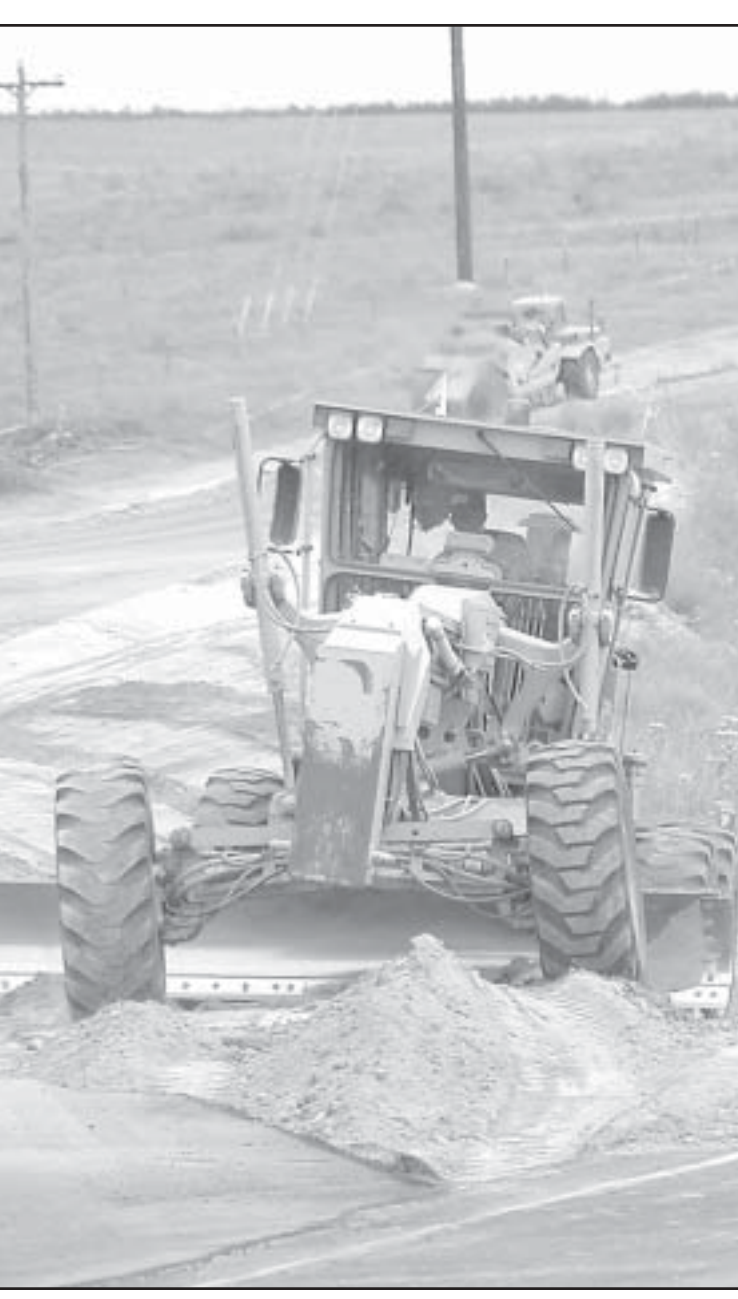
Road crews finished up a shoo-fly detour about five miles west of Norton in preparation for upcoming road work. The detour will allow traffic to flow smoothly around the work.

Mr. Schleicher asked the public to travel safely and slowly through work zones, recognizing the posted speed limits.