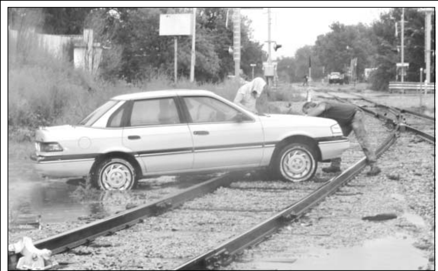
The Norton Police Department, the Norton Sheriff's day afternoon. They managed to free the car by us-Office and several good Samaritans helped out a ing a forklift to lift it and then wedging boards under woman who got her car caught on the tracks Wednes- the tires.