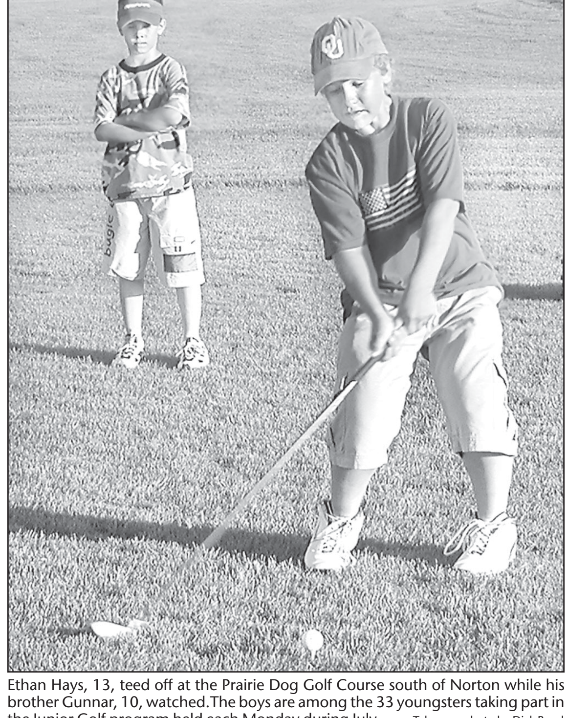
the Junior Golf program held each Monday during July.